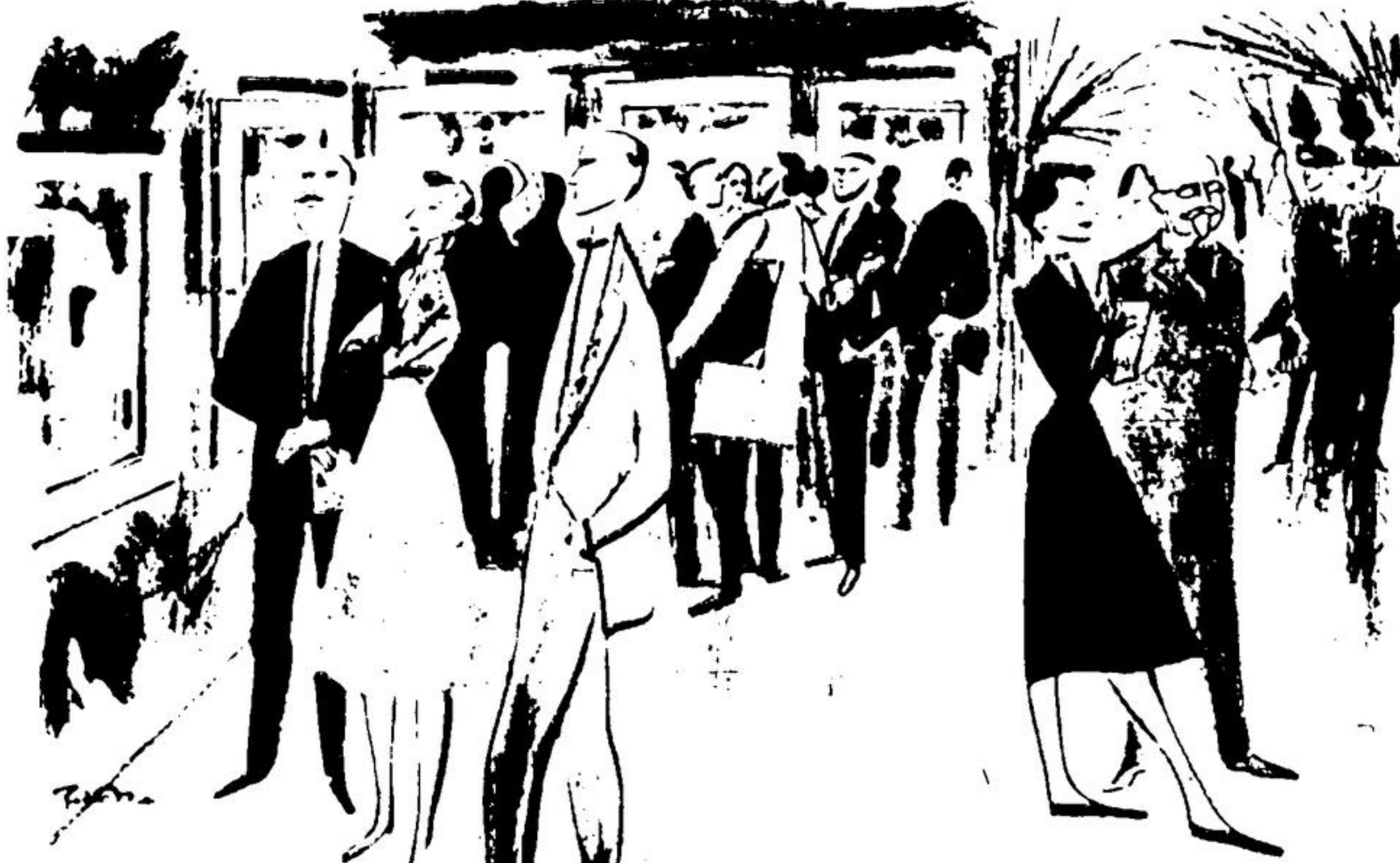
Artist's sketch of the official opening of the Seagram Collection in Rome.

FOR SERVICE & SATISFACTION ALL YEAR ROUND!