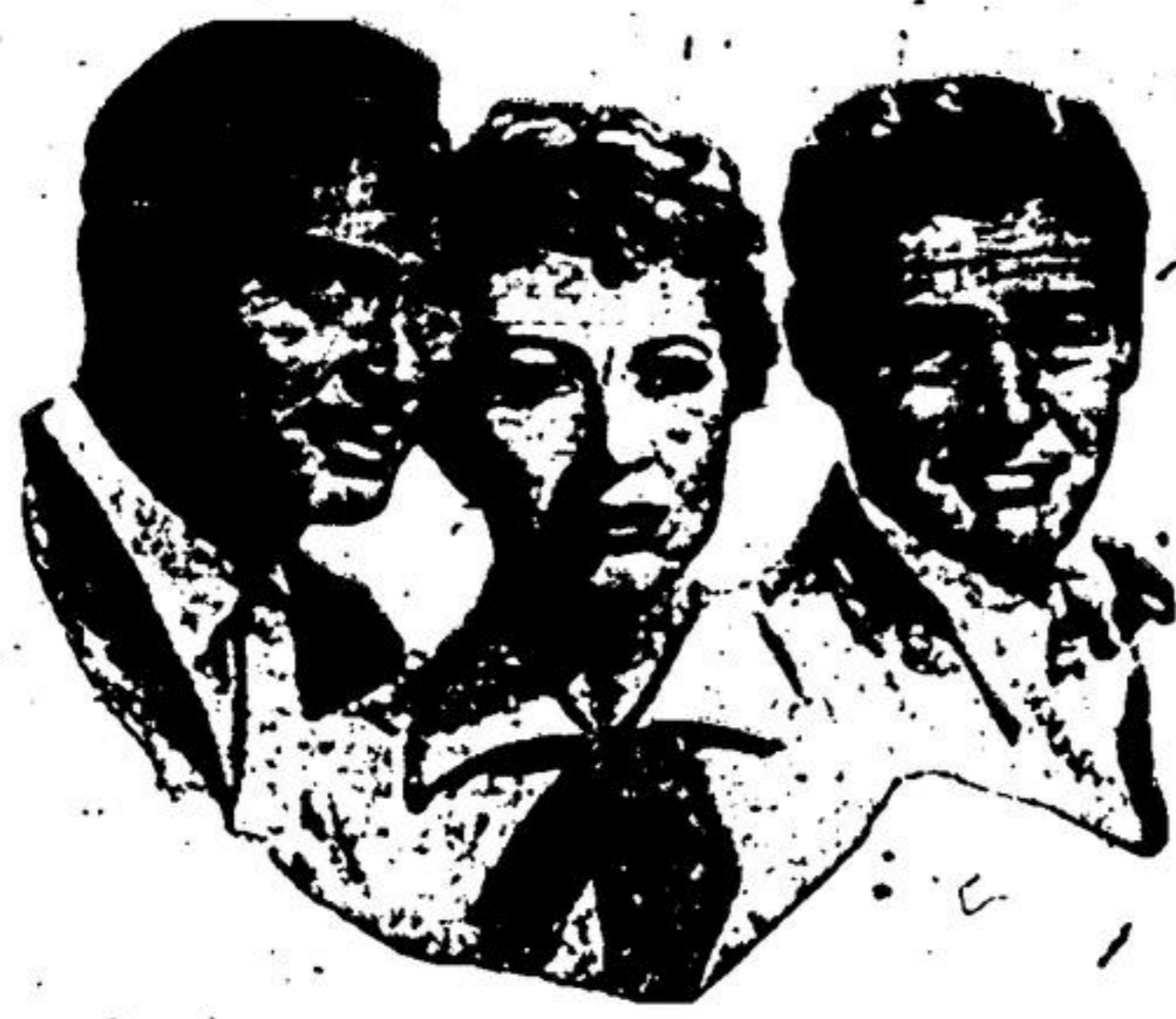
FOURTEEN LEADING MEN is something of a record for Greer Carson in her new starring picture playing at the Roxy next week. In addition to Robert Ryan and Richard Hayden, pictured above, featured players are the "Twelve Little Men" from which the movie takes its name.