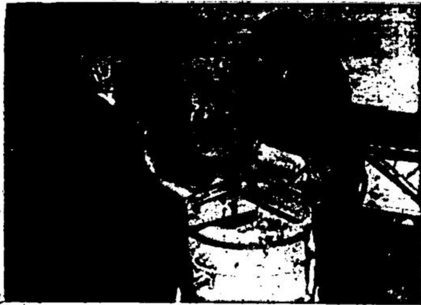
It is not too likely many Georgetown homes will contain as ancient a washing machine as this one, encountered recently by Ontario Hydro's 25 to 60-cycle changeover project. Hydro engineers at the A. W. Manby Service Centre . . . visited this week by Georgetown officials . . . have a slightly puzzled look they check over the old "tub." It is more than 40 years old.