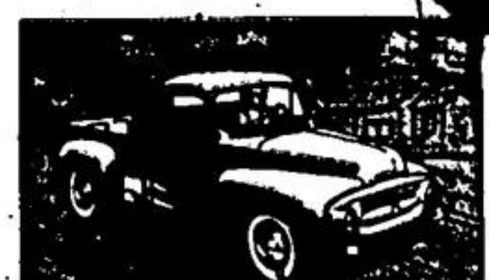
Conto-Walton cab. Improves steering and transmission. Soft-action springs.

Now you can enjoy all the advantages of a pickup and the convenience of a car with the new International 100. It's the pickup with lots of load space and it handles so easily anyone can drive it. Take it shopping, use it on the job. Drive it anywhere... everywhere. It's the most economical double-duty vehicle on the road today.