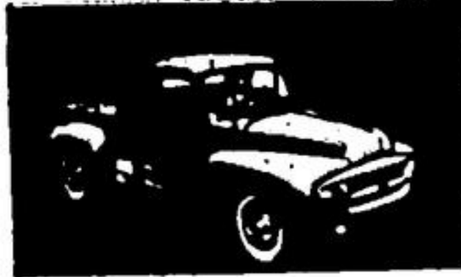
Combo-Model with improved steering and transmission. Soft-ride springs.

Now you can enjoy all the advantages of a pickup and the convenience of a car with the new International 100. It's the pickup with lots of load space and it handles so easily anyone can drive it. Take it shopping, use it on the job. Drive it anywhere... everywhere. It's the most economical double-duty vehicle on the road today.