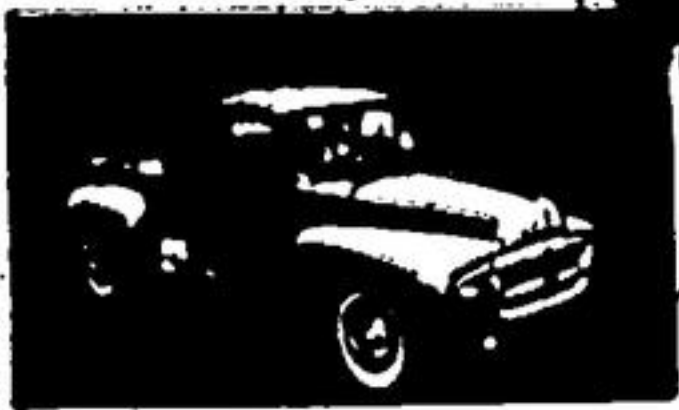
Combo-Vision with improved steering and transmission. Soft-action springs.

Now you can enjoy all the advantages of a pickup and the convenience of a car with the new International 100. It's the pickup with lots of load space and it handles so easily anyone can drive it. Take it shopping, use it on the job. Drive it anywhere... everywhere. It's the most economical double-duty vehicle on the road today.