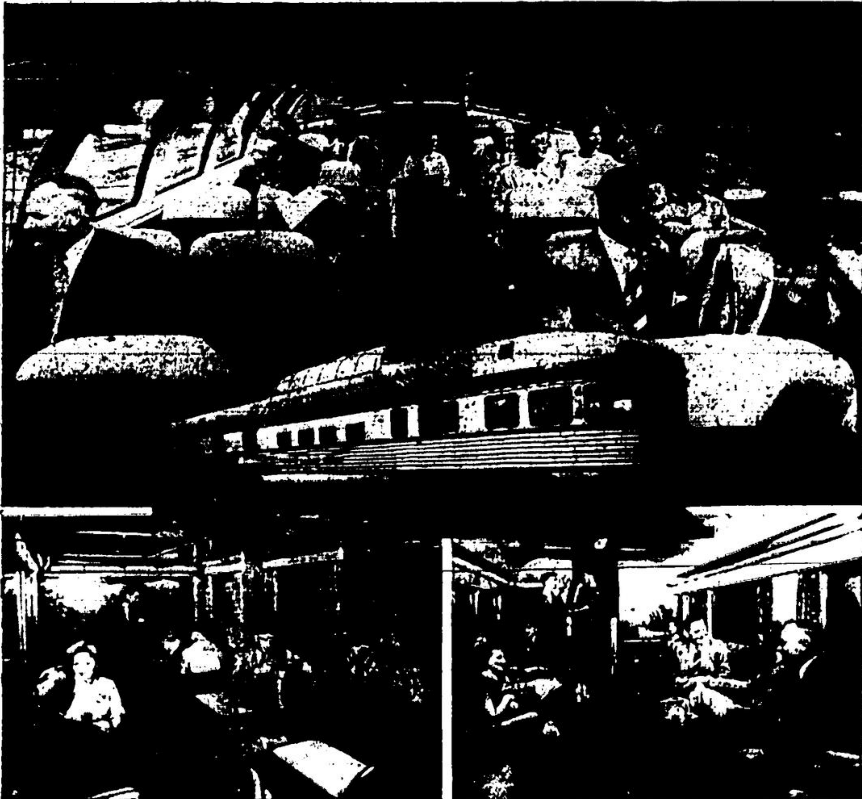
A SERIES OF VIEWS of the Canadian Pacific Railway's new scenic dome lounge cars which will form part of the 15 new streamlined stainless steel trains now on order to replace existing equipment on the transcontinental runs between Montreal and Toronto and Vancouver, is shown above. Eighteen cars of this type, now being displayed in a transcontinental tour of Canada, are included in the CPR's $40,000,000 order for 173 new cars, which will be put into service on existing trains as they are received from the builders, the Budd Company of Philadelphia during the next year. The first of the new scenic dome cars is shown in the centre above, while top photo gives an idea of how Canada's exhilarating scenery will be viewed by Canadian Pacific travellers of the future. Bottom left is a photo of the car's exciting mural lounge, with mural decoration an original oil painting executed by a leading Canadian artist in background. Bottom right is scene in car's lounge, showing curving stairway up to scenic dome.

— Keep them coming, folks. Your cooperation in reporting visits and visitors make a successful social and personal column