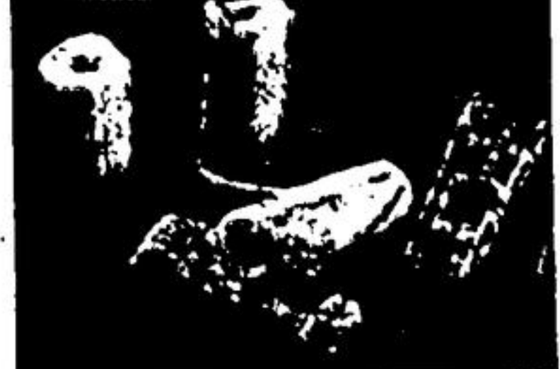
SEVERAL HOT DOGS is simplified now. Stone buy them all ready to roll in "Callie-shaw" bags. Special heater projects heat rays through wrapper, heats winner perfectly in a jiffy.