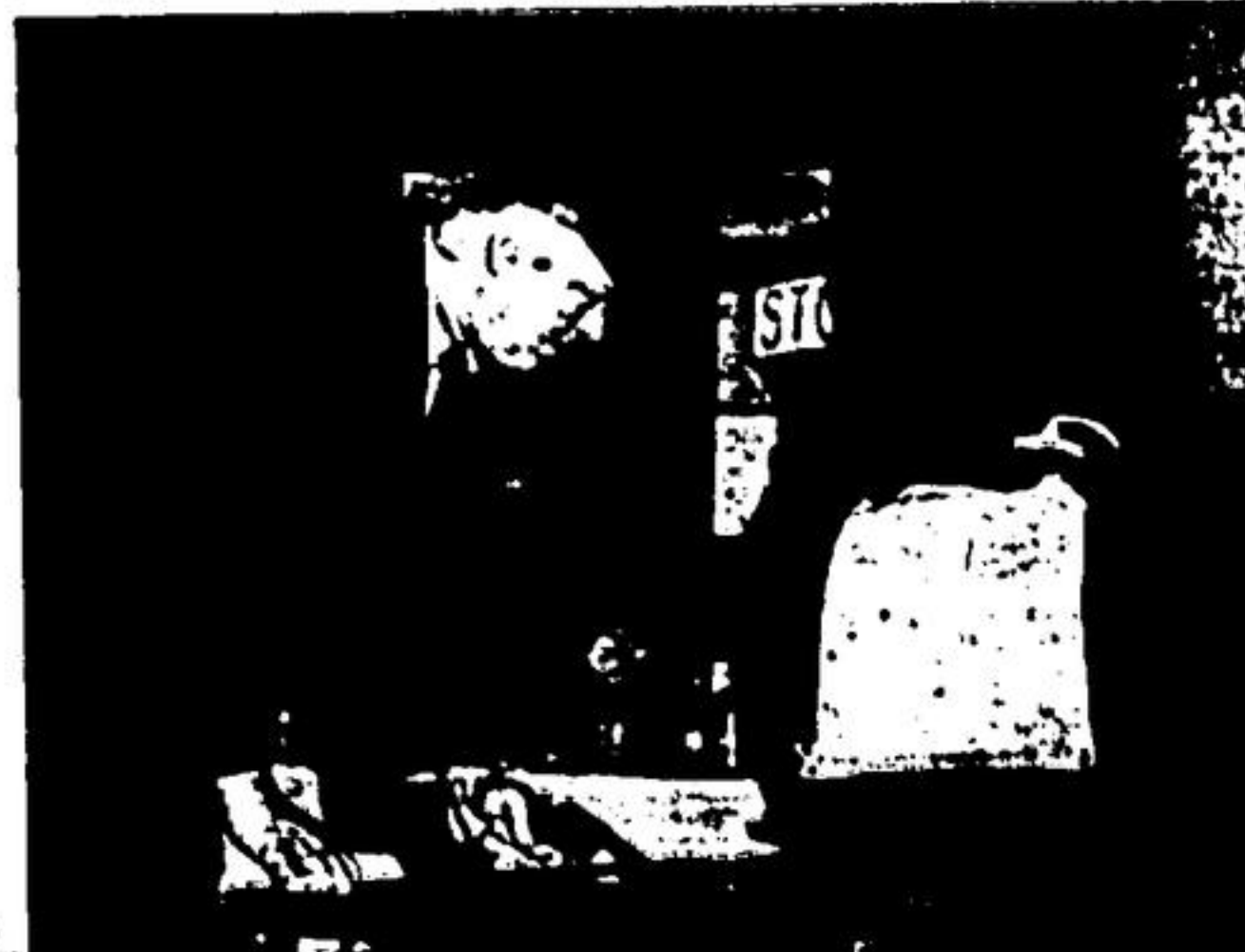
"STOPPING IT OUT" means much less danger for police when they wear this bullet-proof vest which gives complete protection. It's made of five layers of specially-woven nylon. When bullet strikes first layer, stress squeezes around it, bring it to a stop.