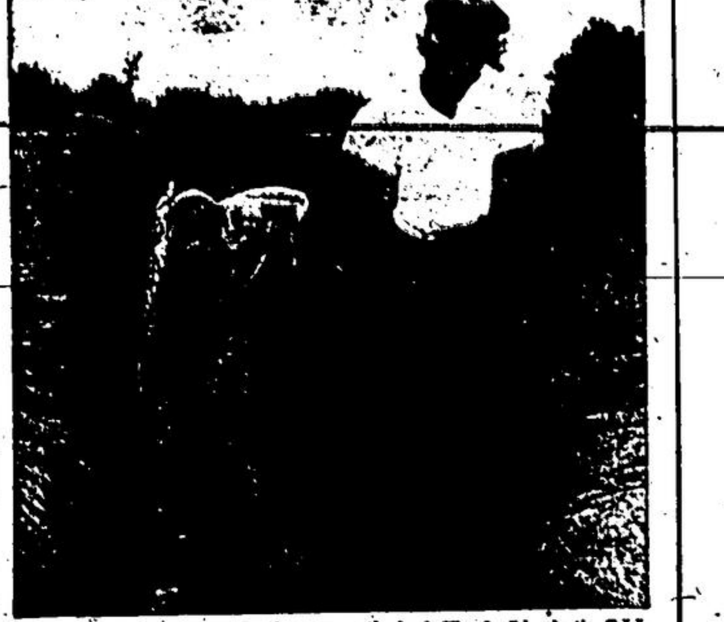
A PIPERMAN COMES TRIM for the man on the lead. The flexible plastic, C-I-L Polythane makes pipe-laying chores a cinch. All he needs are a rough trench, a saw for cutting pipe lengths and a screwdriver for tightening fittings. Flexible polythane bands around joints, curves and corners.