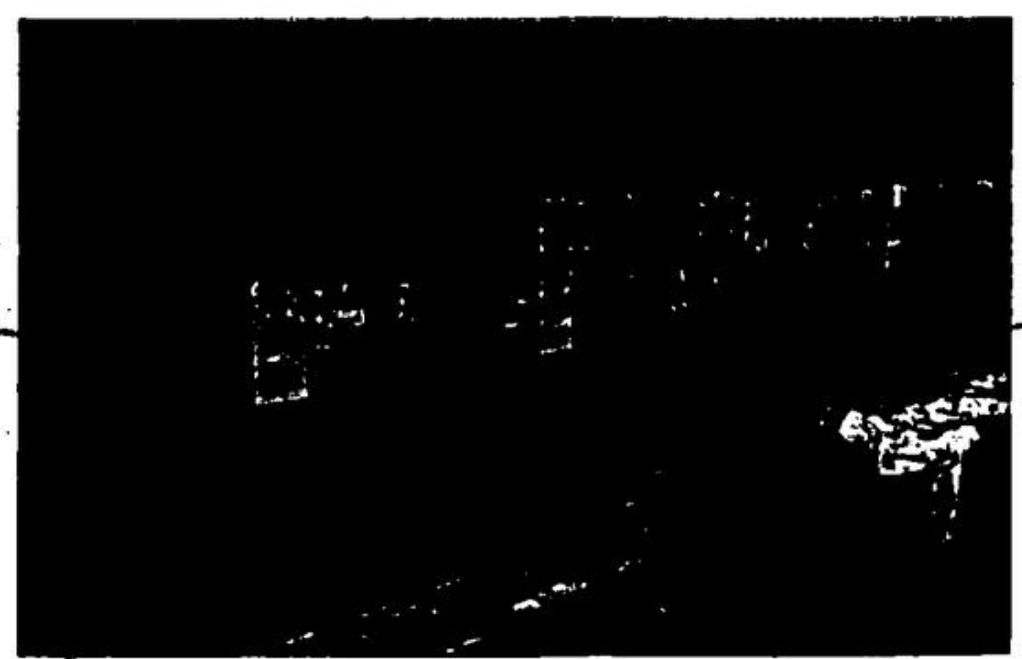
A section of the booths depicting by picture and three-dimensional model, various phases of the work of the United Church in Canada and Overseas, part of the United Church pictorial exposition in Guelph this week.