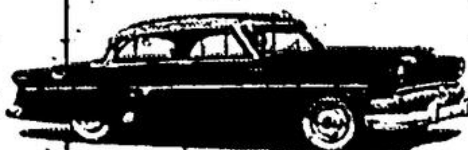
Crestline Sedan... the all-new style-leader in its field whose luxurious appointments will make it perfectly at home in the smartest circles!

Your Ford Dealer invites you to test-drive the new '54 Ford now. See for yourself why Ford V-8 is worth still more in '54.