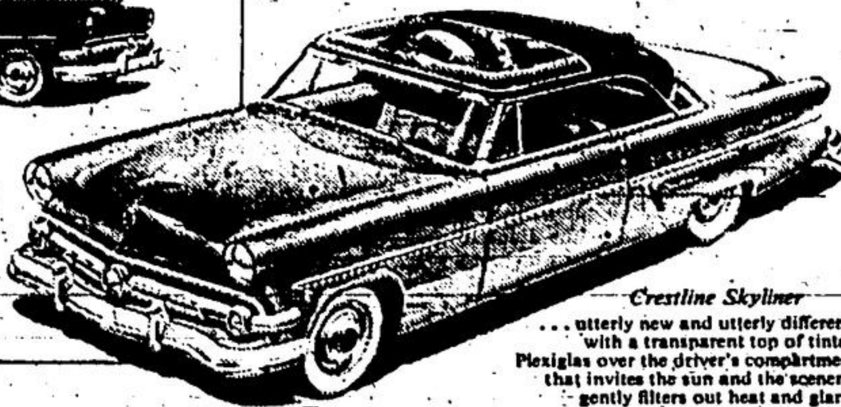
Crestline Skyliner... utterly new and utterly different, with a transparent top of tinted Plexiglas over the driver's compartment that invites the sun and the scenery, gently filters out heat and glare!

PRESENTING 2 THRILLING NEW Crestline MODELS