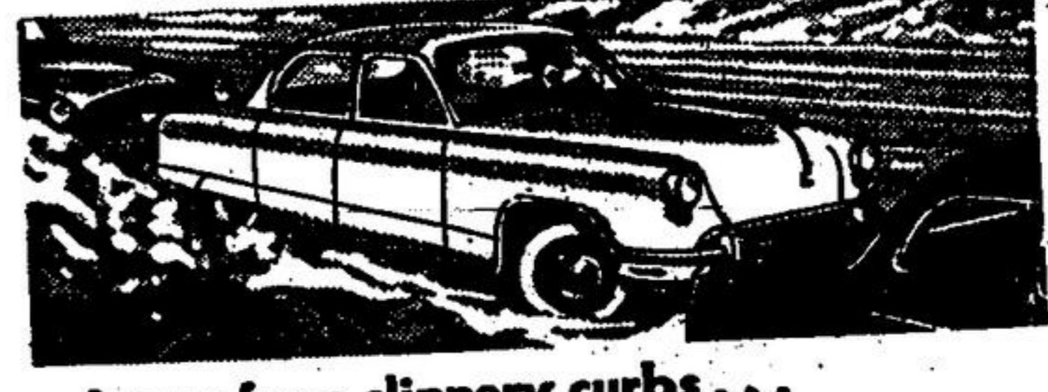
Away from slippery curbs...