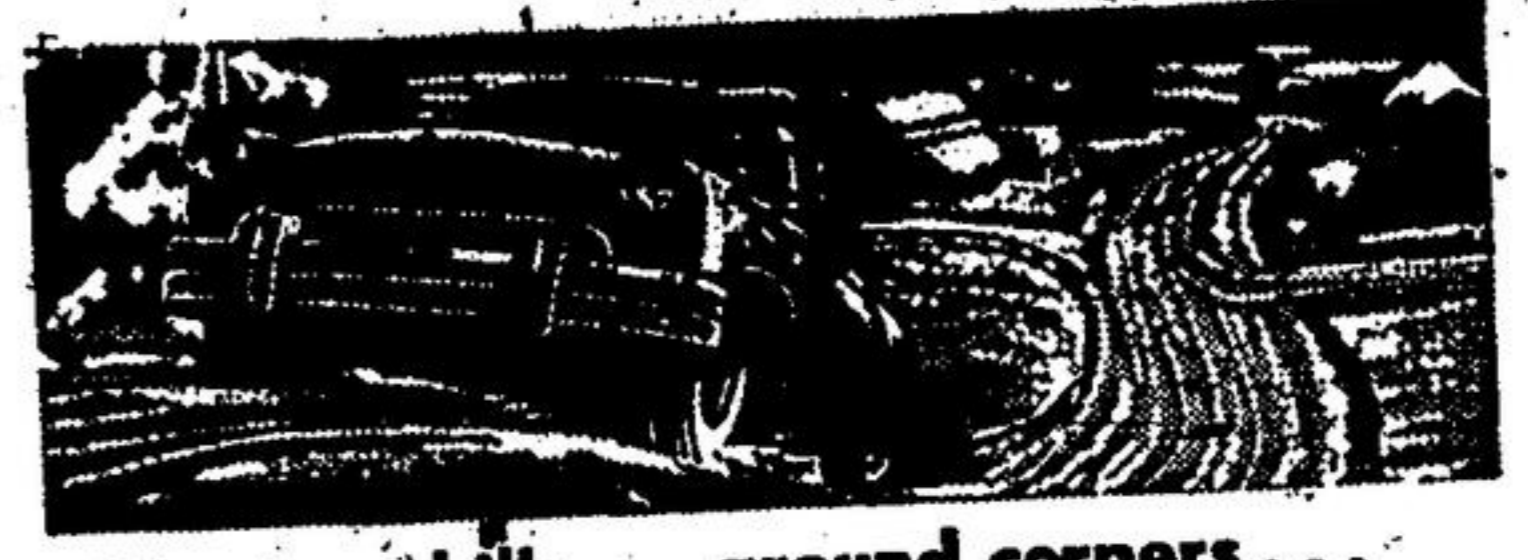
Up steep hills... around corners...