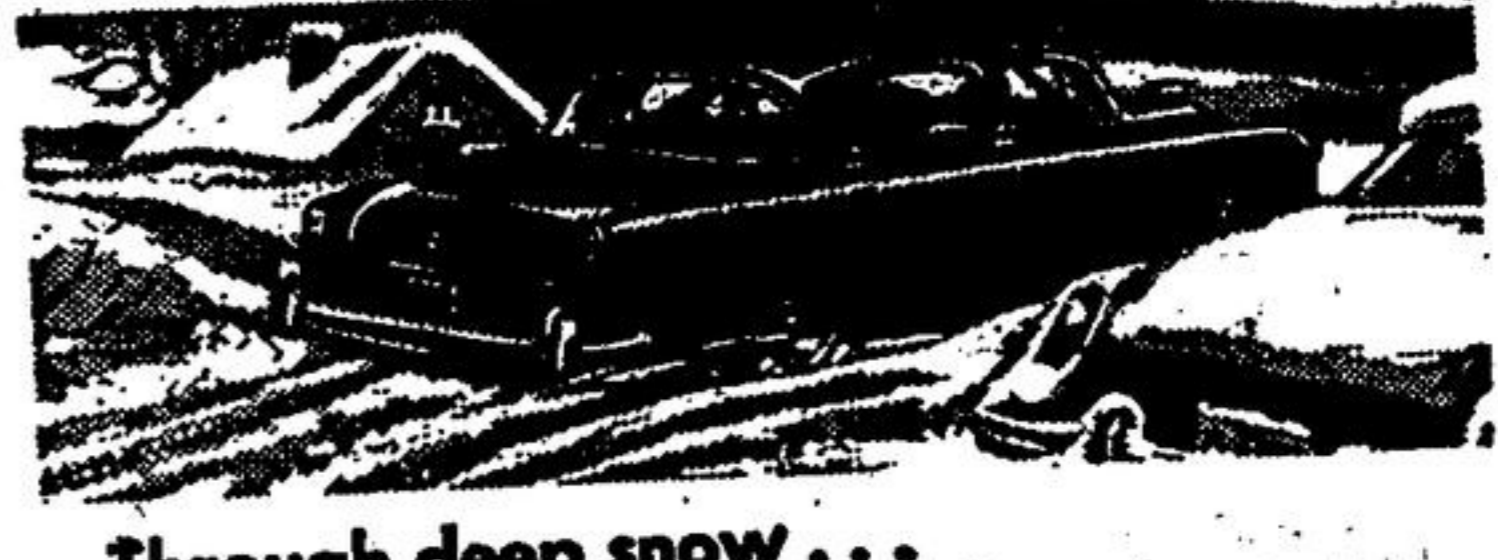
Through deep snow...