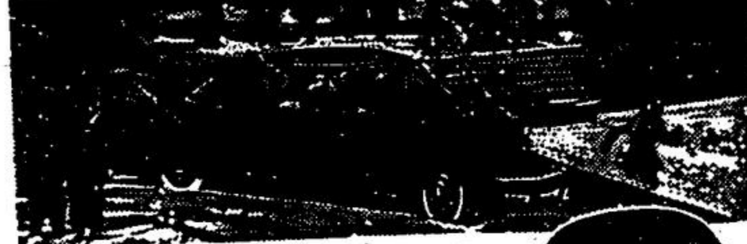
Stop quickly, safely with

QUIET-RUNNING Suburbanite by GOOD YEAR Let us equip your car with a pair today.