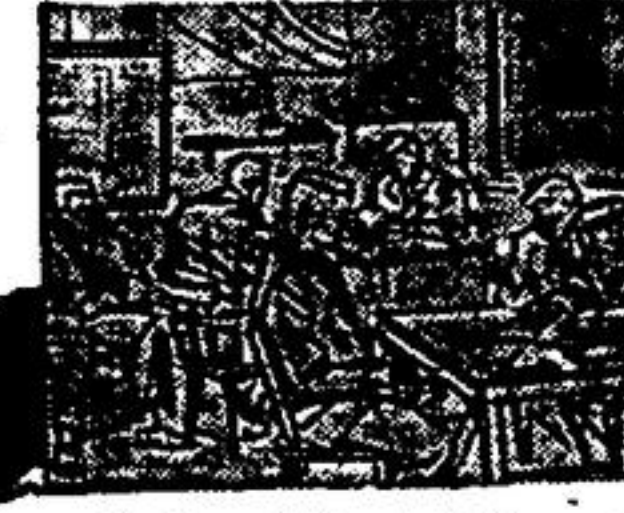
The Army finds out what you can do. Then, where possible, trains you to do it better, and you'll be a better man for it.