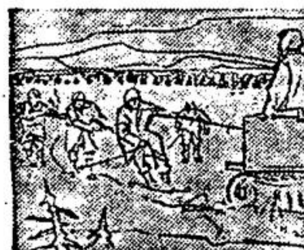
Canada is huge. Our soldiers train for many climate conditions. The Arctic is one of the most important of these.