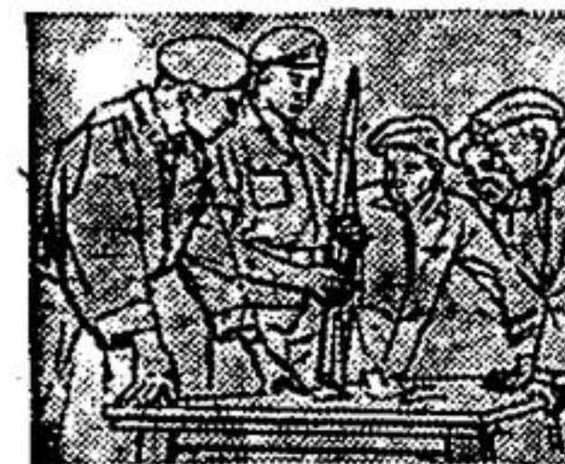
The Army uses the most modern equipment available. More men, to use and instruct others in these weapons, are needed immediately.