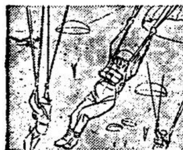
Soldiers of the sky — Canada's finest! These men — and you have to be good to be a Paratrooper — are trained to strike hard and fast.