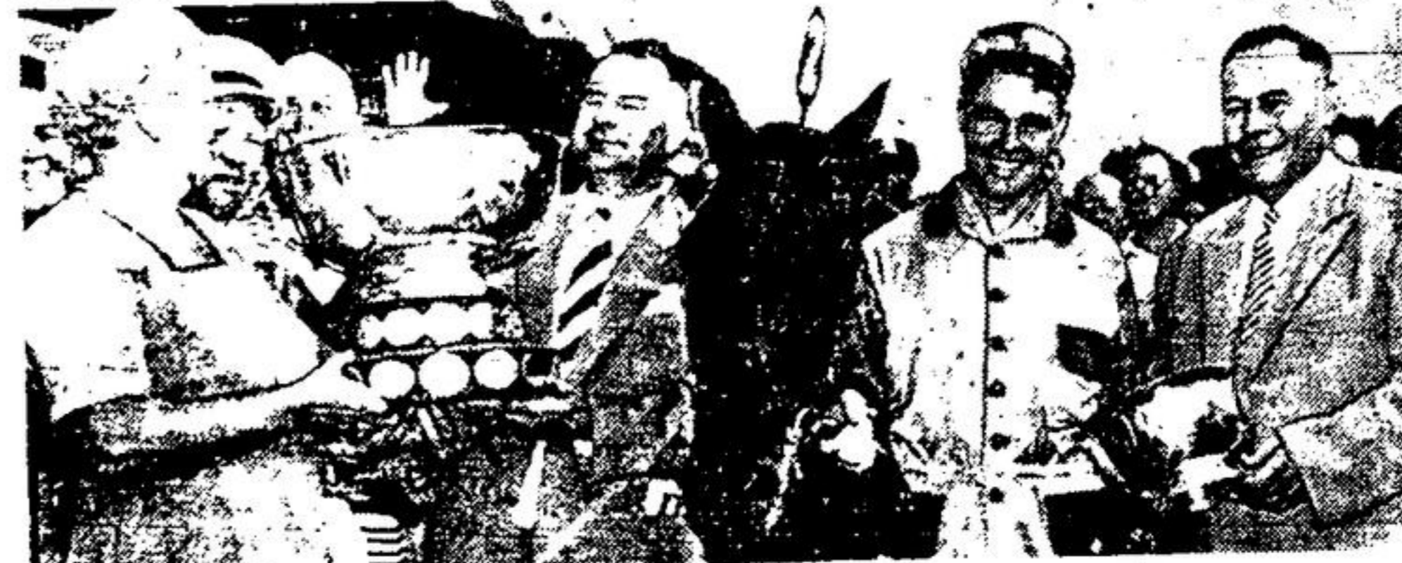
ALL SMILES NOW, PLEASE