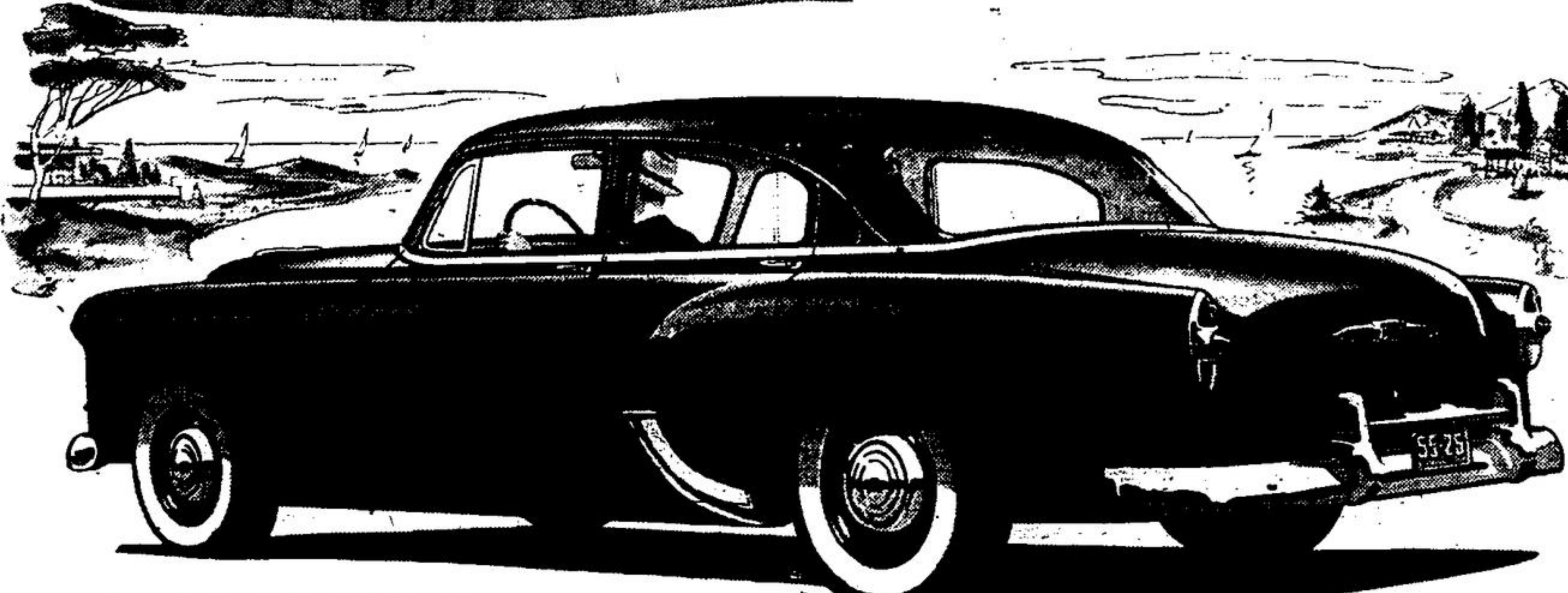
Illustrated — Chevrolet "One-Fifty" 4-Door Sedan

Any way you look at it THERE'S NO VALUE LIKE CHEVROLET VALUE!