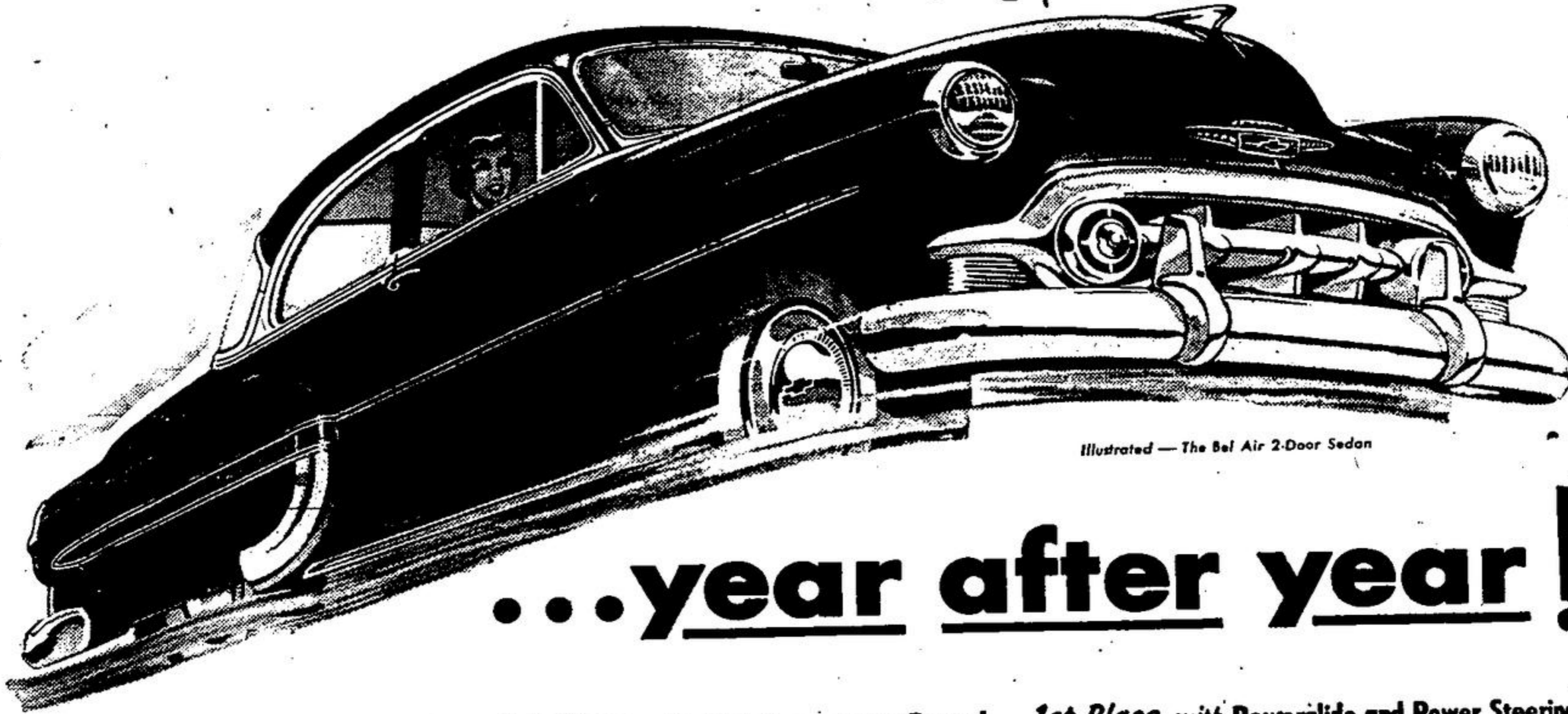
Illustrated — The Bel Air 2-Door Sedan