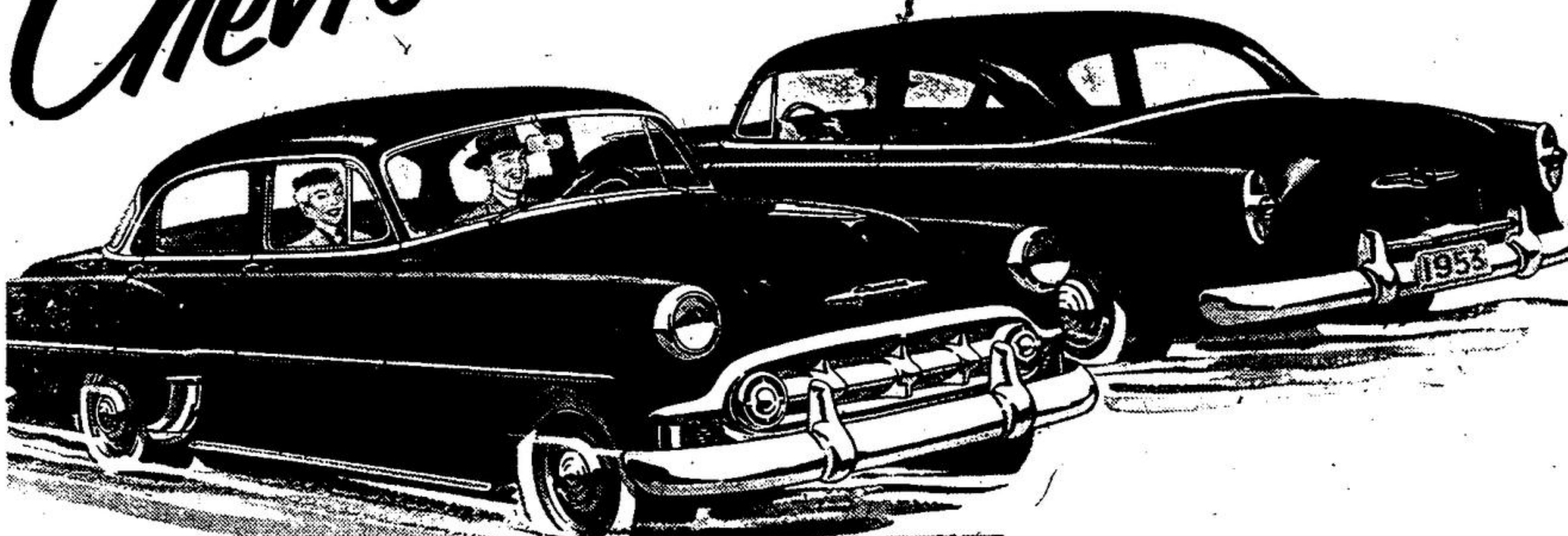
Above: The "Two-Ten" 4-Door Sedan. At right: The "One-Fifty" 2-Door Sedan, two of 16 beautiful models in 3 great new series.