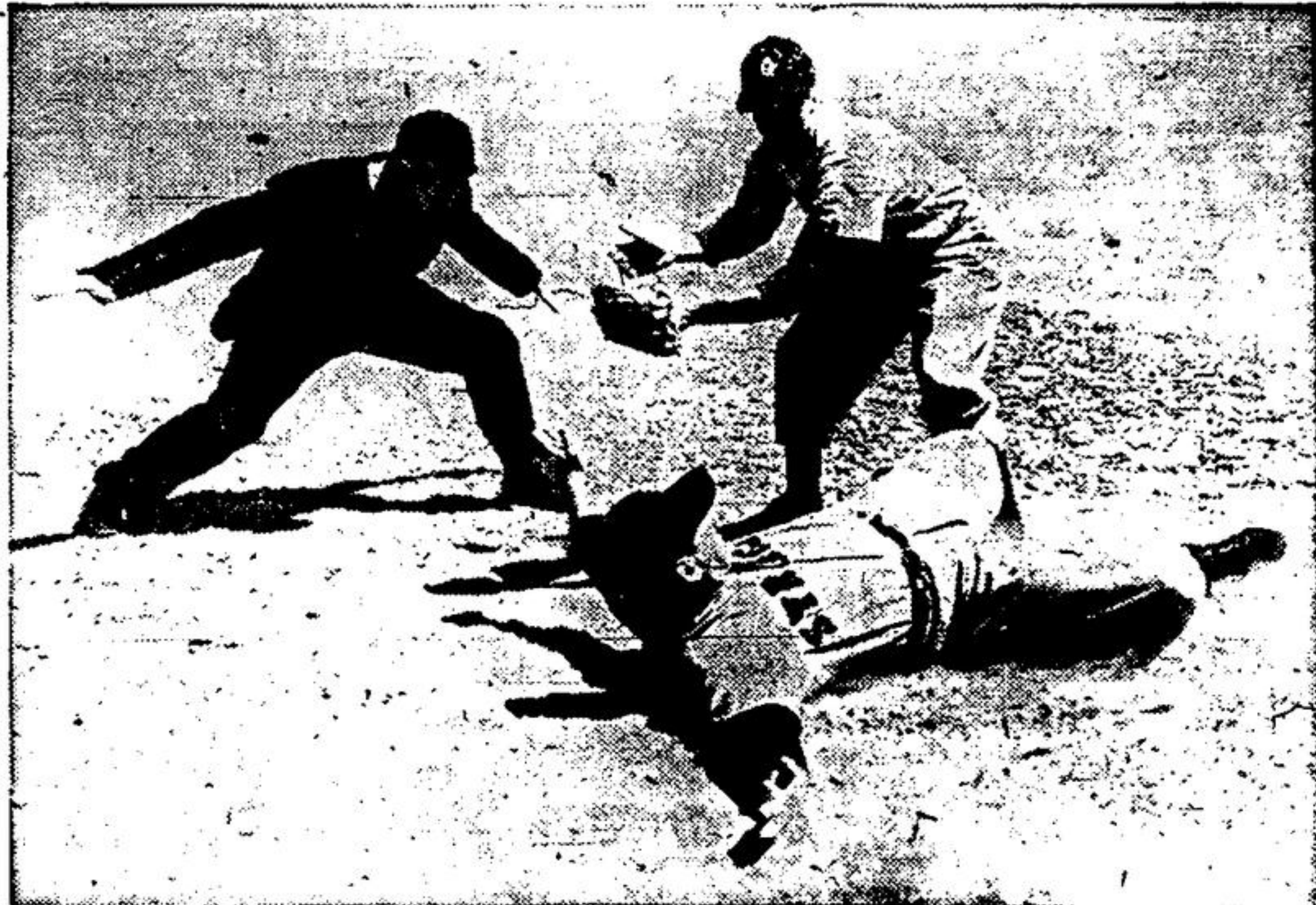
Beakell Spring Training