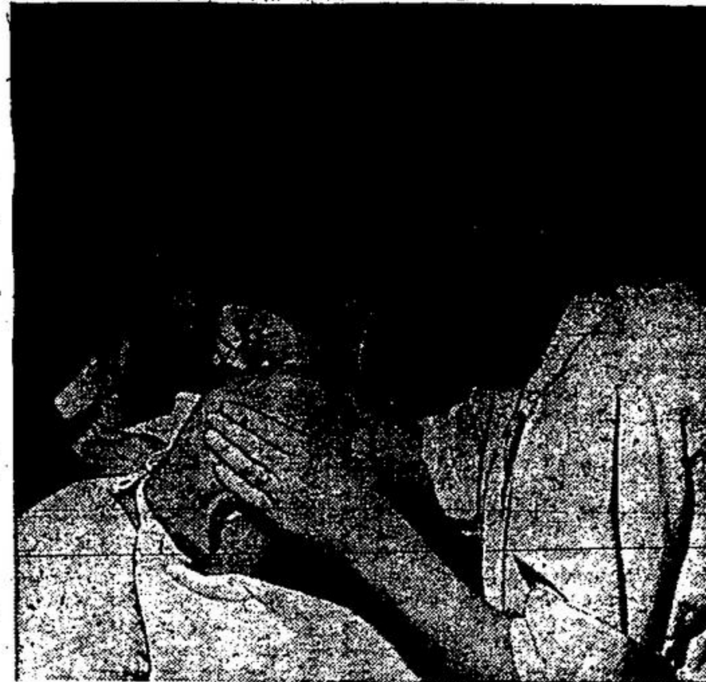
Mycois, a highly contagious fungus infection of the scalp, reached near-epidemic proportions in certain areas under wartime conditions. In Yugoslavia, the World Health Organization and the United Nations International Children's Emergency Fund joined with the Government to strike at this disease which, unchecked, results in permanent loss of the hair. Trained technicians, working with UNICEF-supplied X-ray equipment to remove fungus-infected hair, are effecting rapid cures. Pictured above, hospital workers remove remaining hairs from children's heads after zinc-oxide treatment.