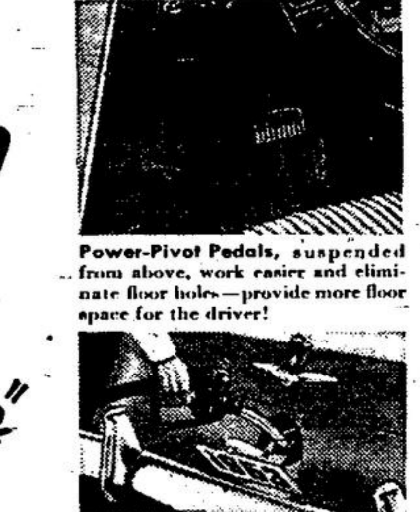
Power-Pivot Pedals, suspended from above, work easier and eliminate floor holes—provide more floor space for the driver!

ibility that really lets you see... a car that handles with effortless steering, braking and parking... with proved V-8 power and brilliant performance. See it... check it... you'll find the 1953 Ford gives you so many things you need and want. Test-Drive Ford—you'll know why, more than ever before, the king is to Ford!