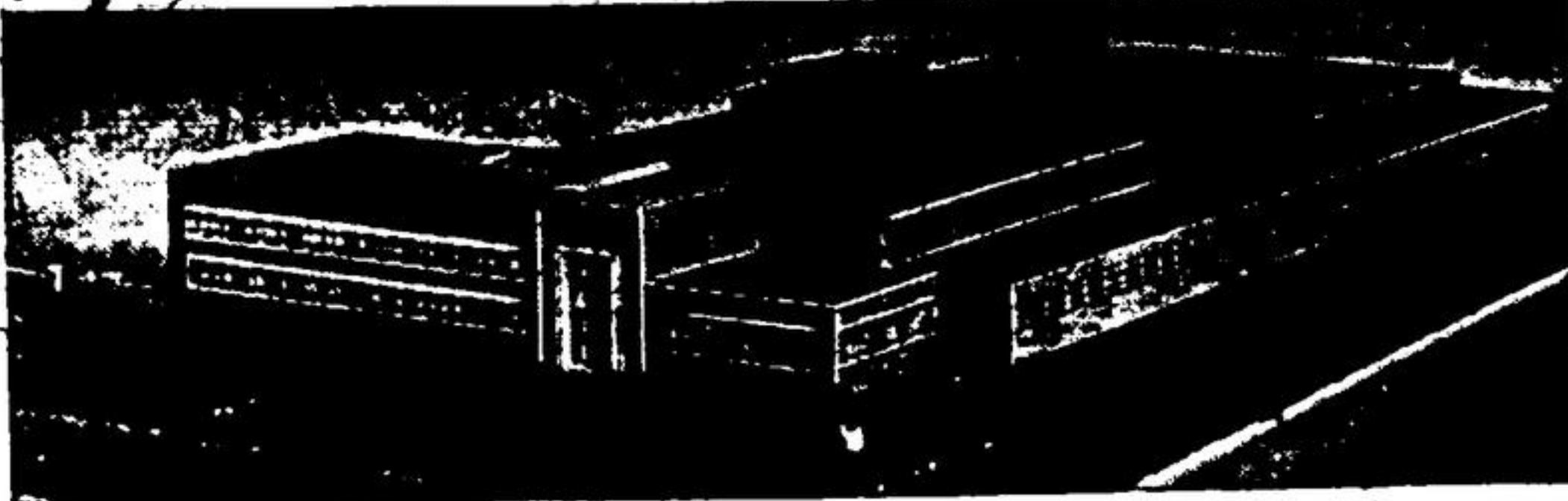
This is the new "SALADA" Tea Building now being erected on Cote de Liesse Road in the Town of Mount Royal, Quebec. It will have a floor space of 125,000 square feet and will feature the modern innovation in North America of blending, packing and shipping on one floor. The building will be completed in 1952, the year which marks the 60th anniversary of the Salada Company and will serve Eastern and part of Central Canada. The other "SALADA" buildings are in Toronto and Boston.

Architects—Ross, Patterson, Townsend and Fish, Montreal.