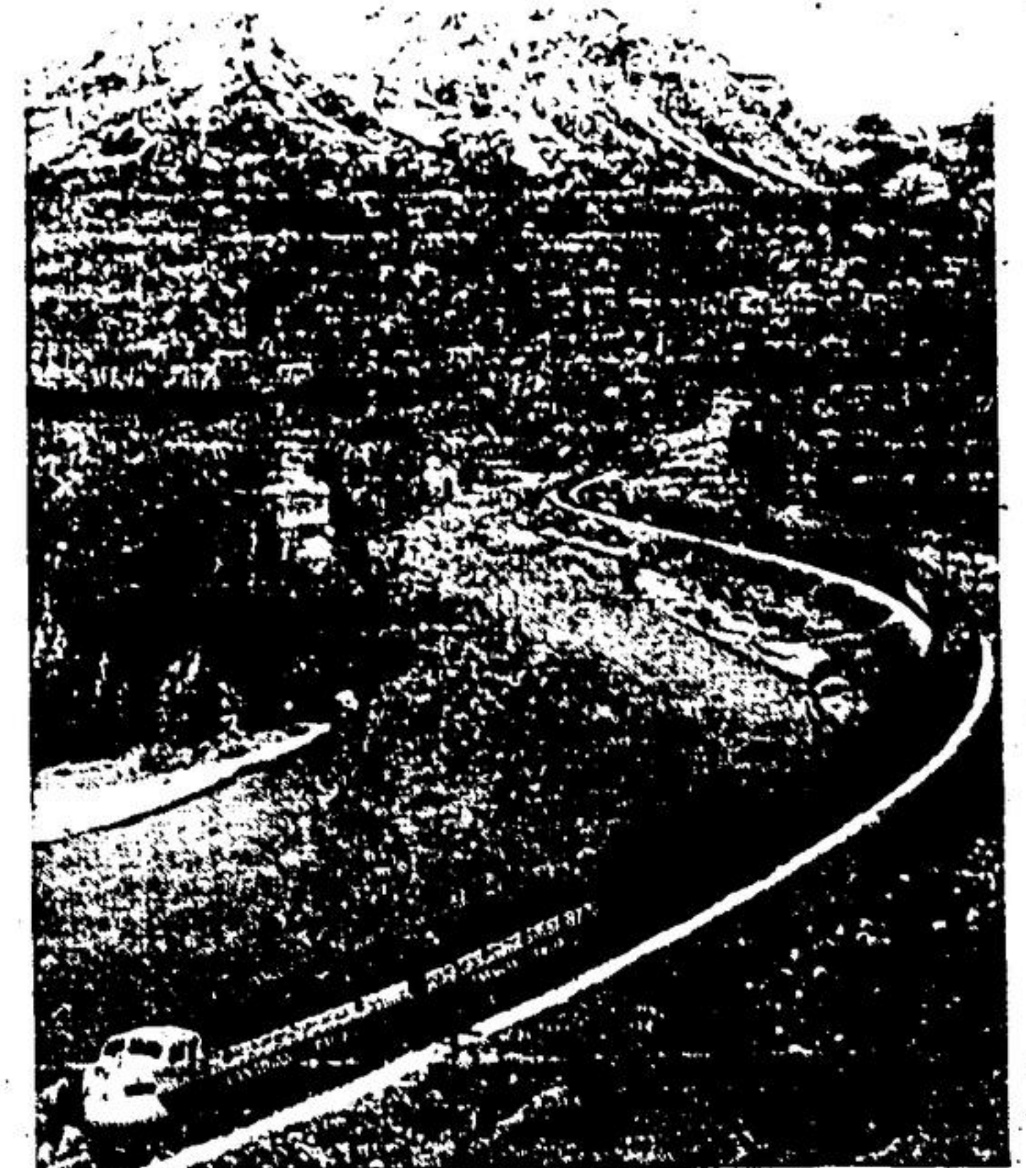
ROCKY MOUNTAIN DIESELS: A tired one of 48 new diesel units new era of mountain railroading in which the CPR has acquired since Canada is being unfolded as modern diesel train operations streamlines Canadian Pacific in the Rockies and Alberta foot-corn steamline Canadian Pacific between Revelstoke, B.C. and Railway diesels; the first to go into hills, between Revelstoke, B.C. and service in the Rocky Mountains, Calgary, Alta.; as they pull a passenger steam locomotive, longtime senger train past towering peaks conquerors of the steep slopes and near Lake Louise, rugged mountain wilderness. Pic-

McClures HOME FURNISHINGS STORE We believe in selling satisfaction