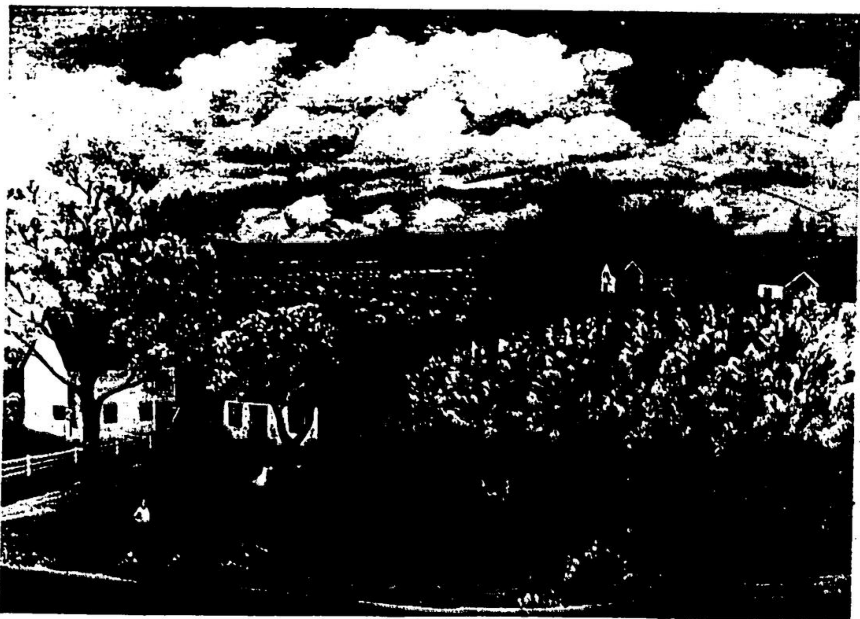
Canadian Apples are noted the world around for their delightfully clean taste.

DEAD STOCK Dead and crippled Farm Animals removed promptly for sanitary disposal. Telephone Collect Toronto EM-3-3636 Georgetown 11 Gordon Young Ltd.