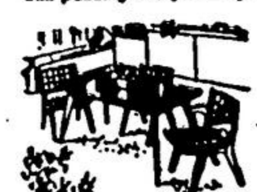
PANELYTE the superior laminated plastic is ideally suited to the modern functional trend in design, in both horizontal and vertical surfaces.

PANELYTE The Beautiful Surface READY MADE - TO LAST