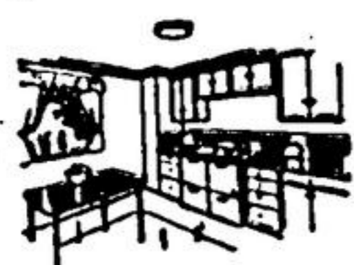
In the kitchen, get colorful Panelyte in impervious to fruit acid, boiling water, household cleaning fluids—is simple to keep gleaming clean.