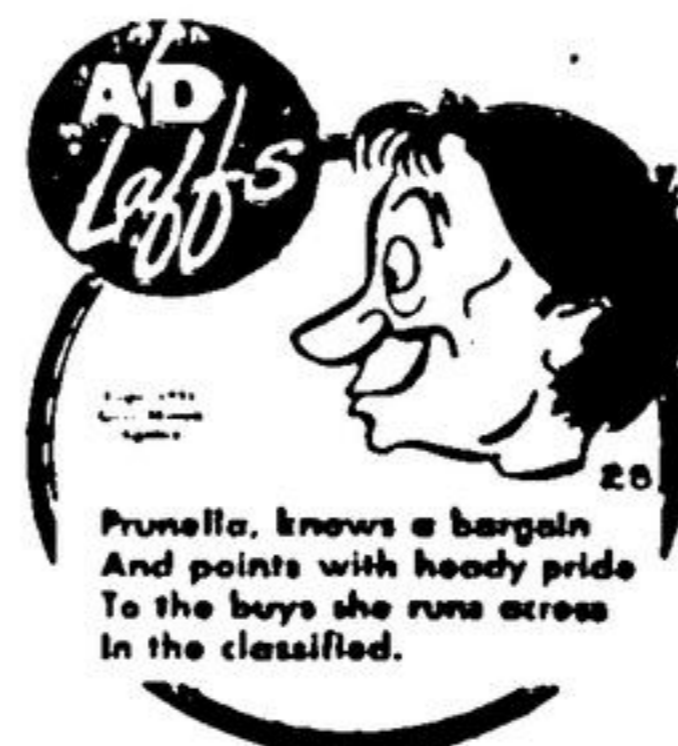
Prunella knows a bargain And points with heady pride To the buys she runs across In the classified.