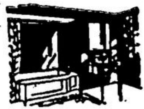
For the bathroom, a bright surface unharmed by steam, hot water, ammonia, a sur- face that will not rust, stain or warp.