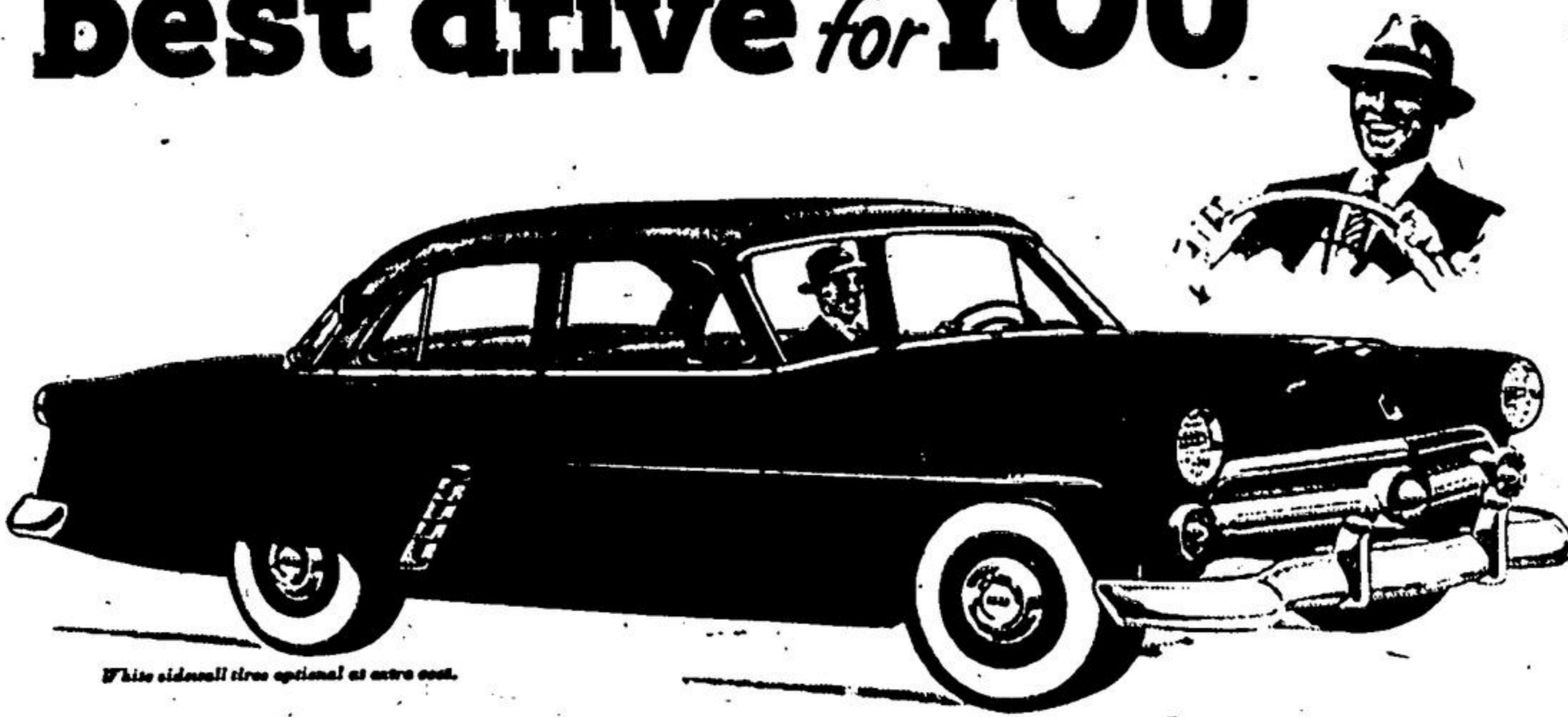
This sidemount drive optional at extra cost.