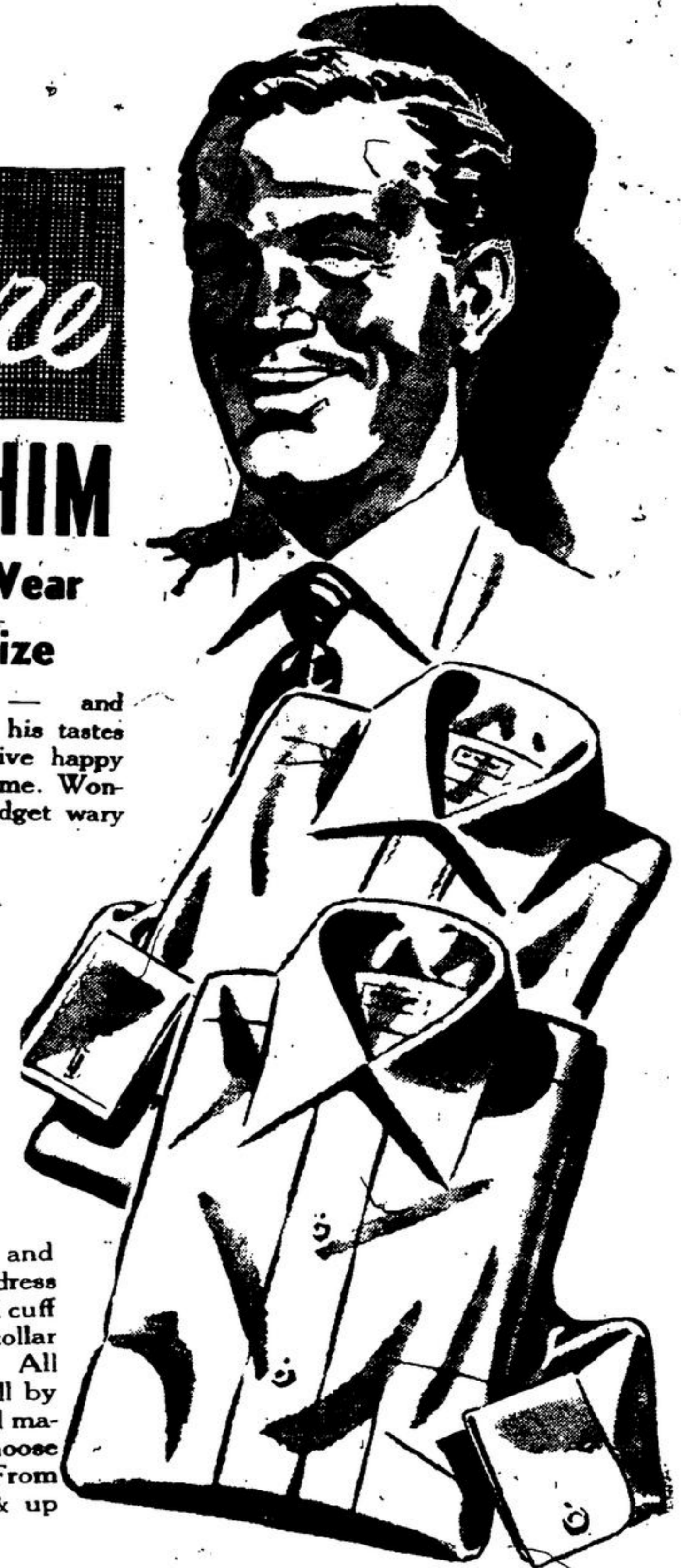
White and colored dress shirts. All cuff and collar styles. All sizes. All by renowned makers. Choose several. From $2.95 & up

See our huge collection of gifts for Him — and whatever his build — whatever his tastes you're sure to find just the gifts he'll give happy thanks for — for many a month to come. Wonderfully — our top quality group has budget wary price tags.