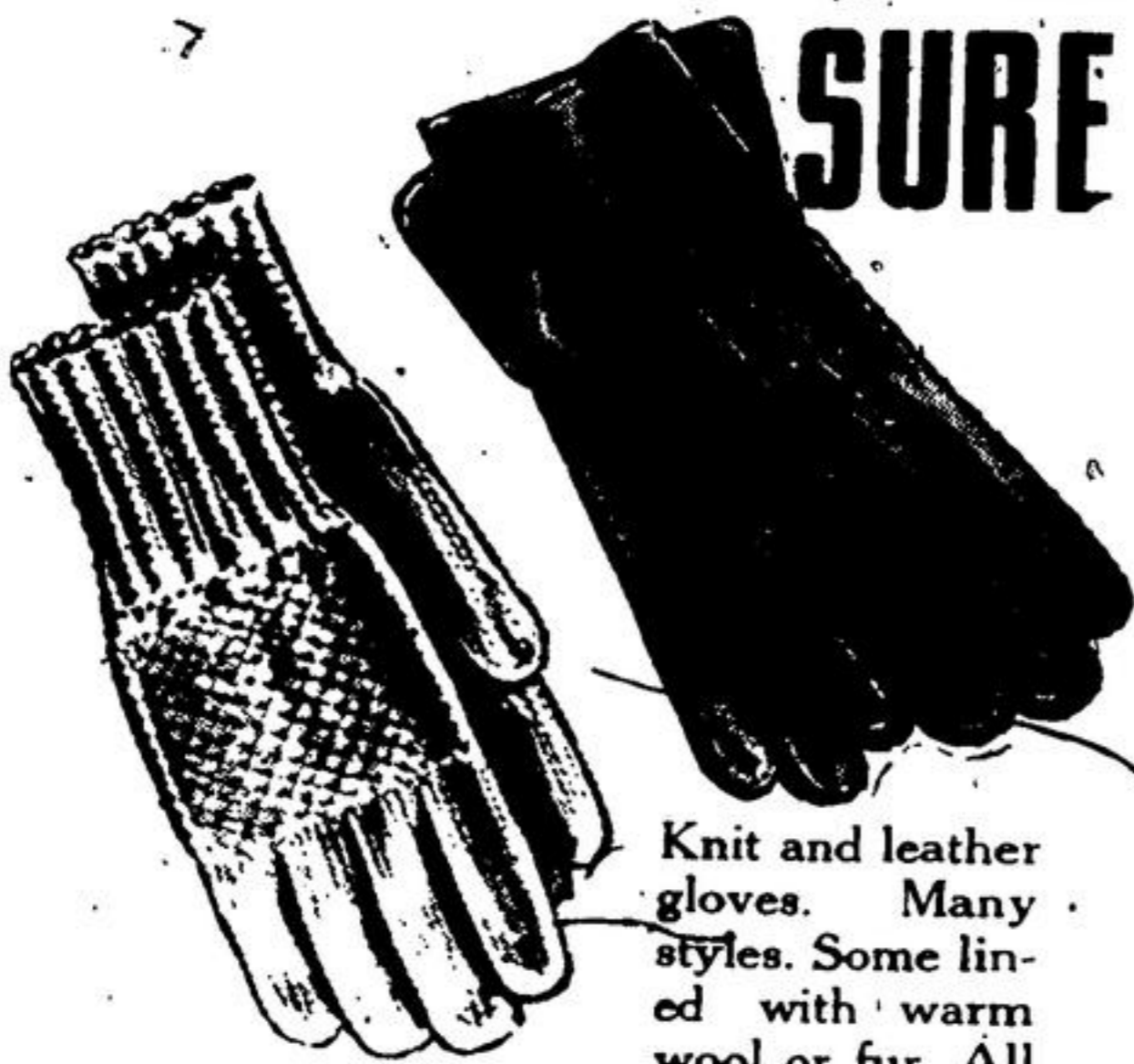
Knit and leather gloves. Many styles. Some lined with warm wool or fur. All colors and sizes. $1.65 and up