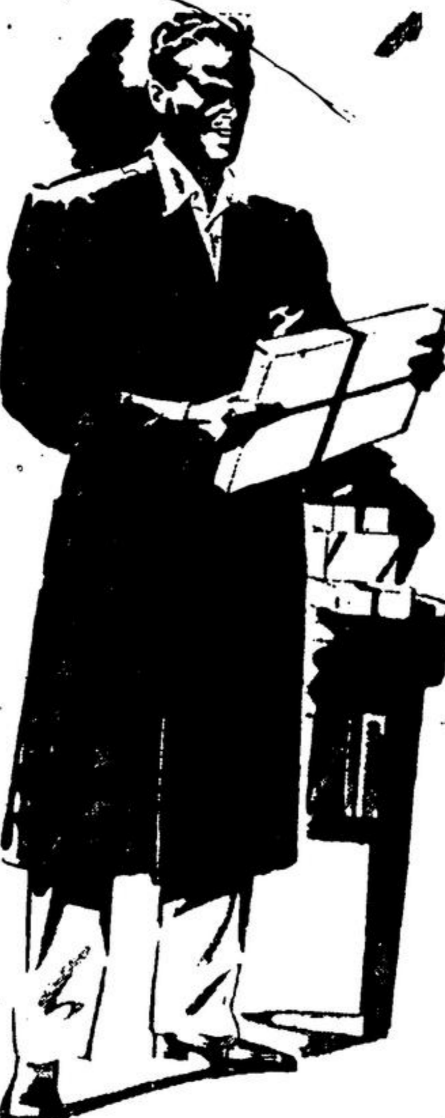
Lounging robes in his favorite classic styles. Flannels, silks, satins. Many colors. $10.95 and up