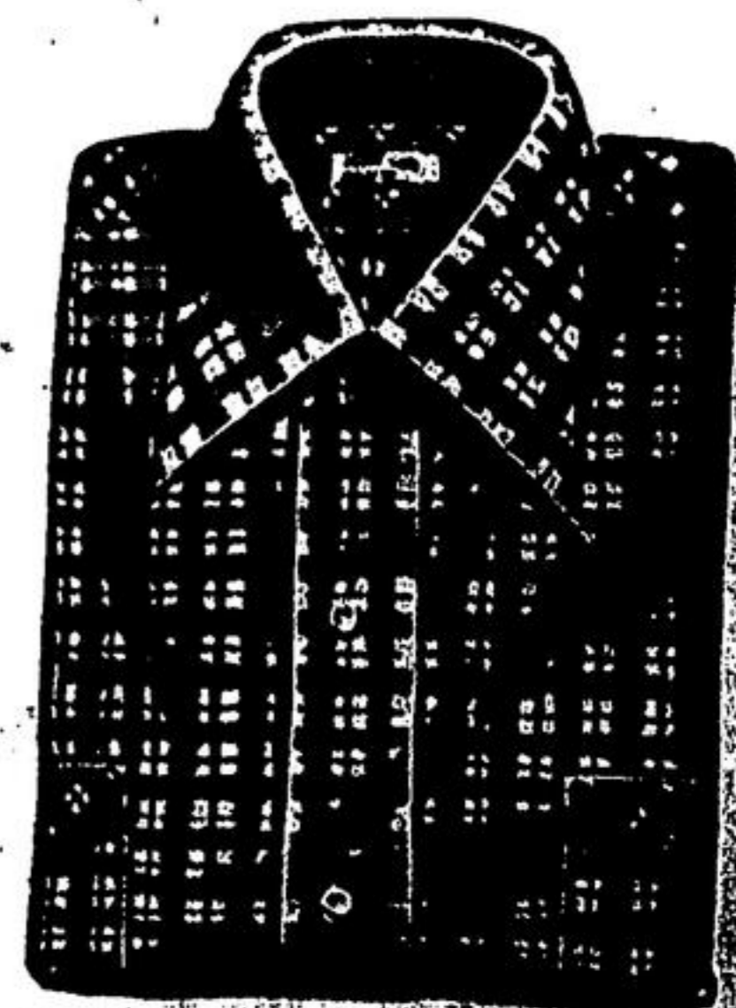
Printed and plain, long and short sleeve sporty shirts. Wools, cottons, mixtures. All sizes. $3.95 and up