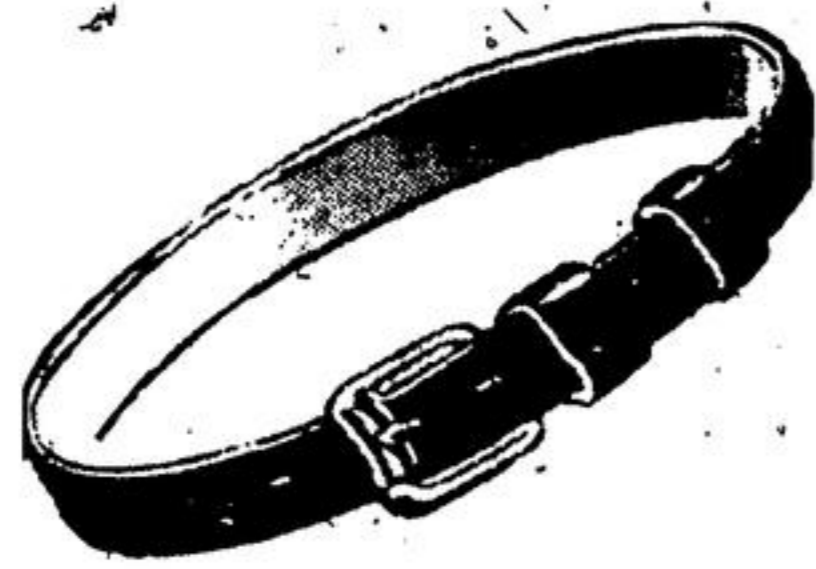
Leather belts. Variety of colors, widths. All sizes. $1.00 and up

J. B. MACKENZIE & SON Lumber Coal Building Supplies