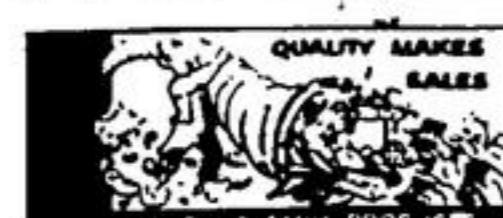
"Quality Makes Sales" tells how to get quality with volume at an economical production cost.

TO MY WORKERS AND SUPPORTERS IN THE RECENT ELECTION CAMPAIGN