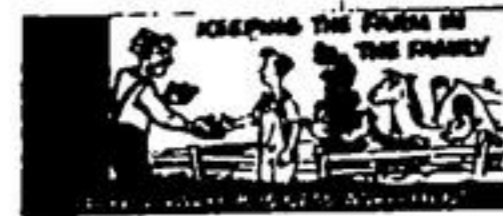
"Keeping the Farm in the Family" shows how a farm can be run as a profit-sharing partnership.