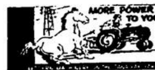
"More Power to You" explains farm mechanization in keeping with good business practice.

Be sure to ask for your copies of these booklets. They are available at any Commerce branch.