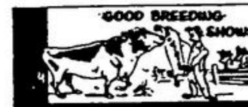
"Good Breeding Shows" outlines the combination of factors which help you to realize top production.