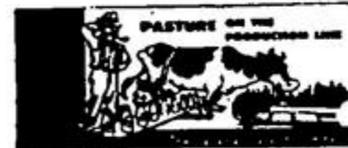
"Pasture on the Production Line" deals with grazing control and soil conservation necessary for better land use.