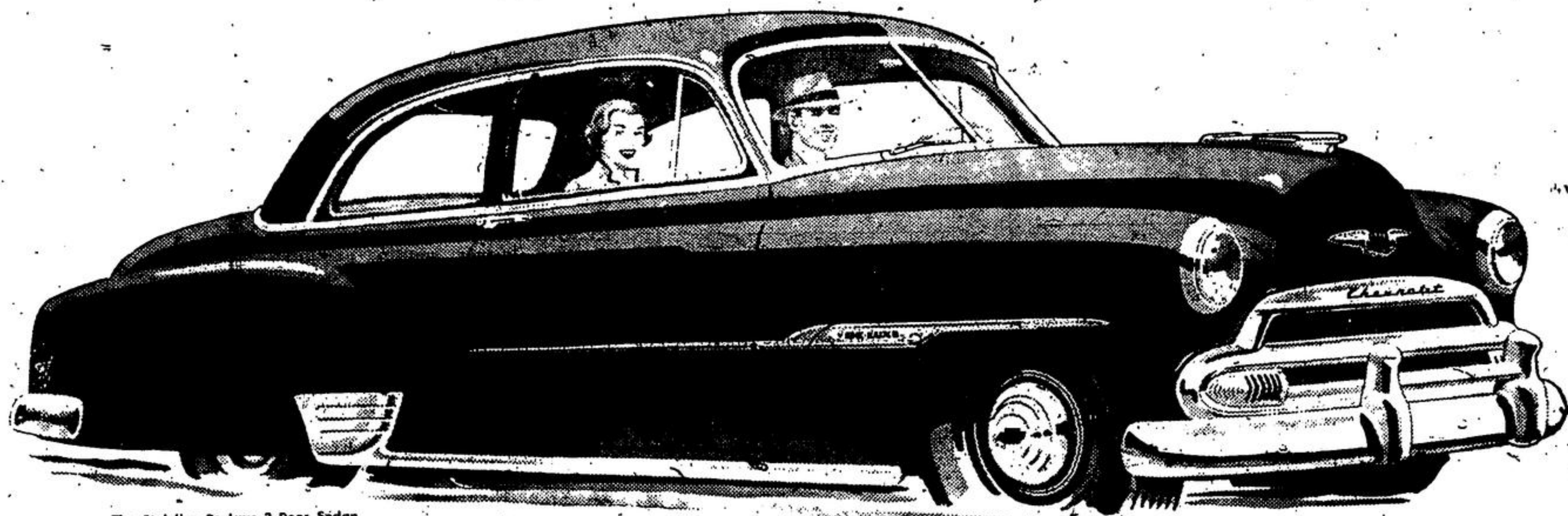
The Styline De Luxe 2-Door Sedan (Continuation of standard equipment and trim illustrated is dependent on availability of materials.)

Yes... largest in its field! Yes... finest in its field! Yes... lowest-priced line in its field!