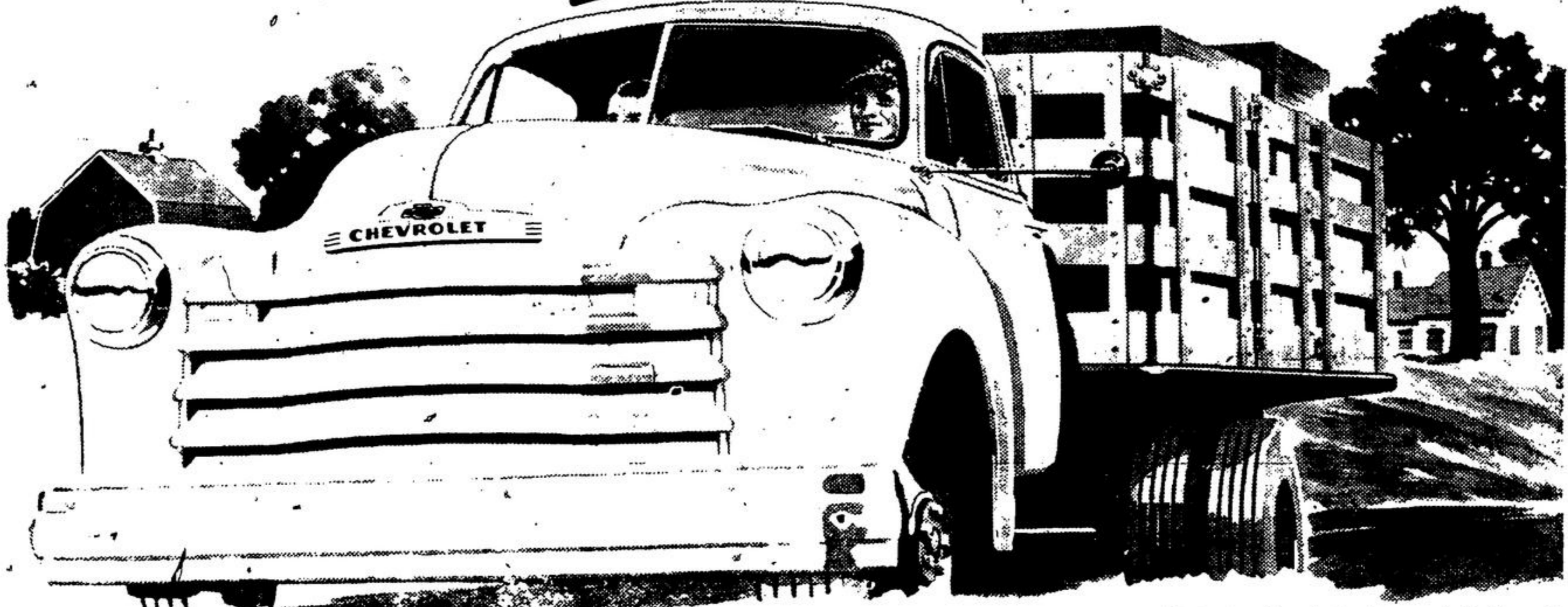
(Continuation of standard equipment and trim illustrated is dependent on availability of material)

greater economy engineered in! ... to do more work for your money