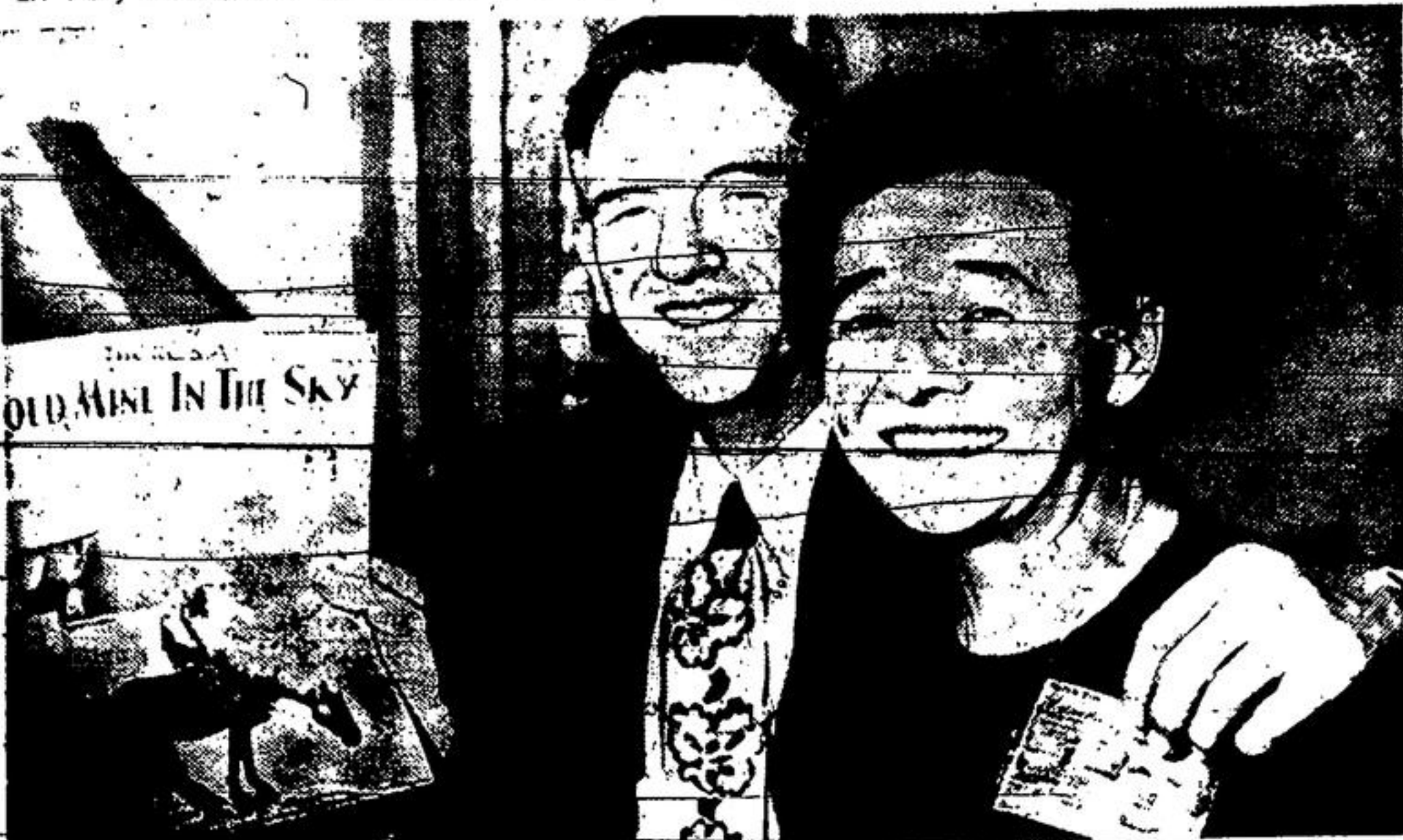
THEY BELIEVE IN SONG TITLES