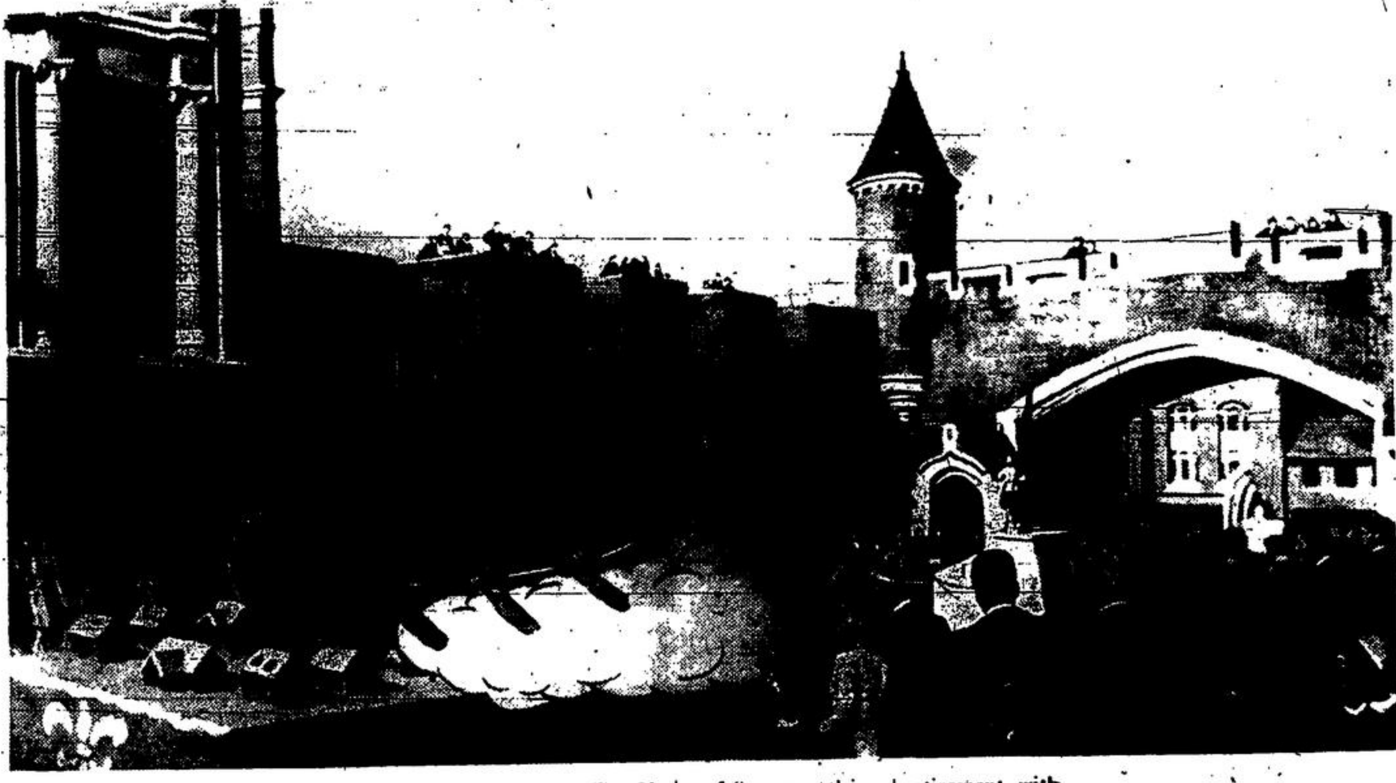
Created and signed by The House of Seagram, this advertisement, with appropriate copy for foreign lands, is appearing in magazines and newspapers printed in various languages and circulated throughout the world.

The colourful pageantry of the annual St. Jean Baptiste Festival is French Canada's tribute to its patron saint. Parades and floats in cities, towns and villages recreate the legends and history of the old Province of Quebec.