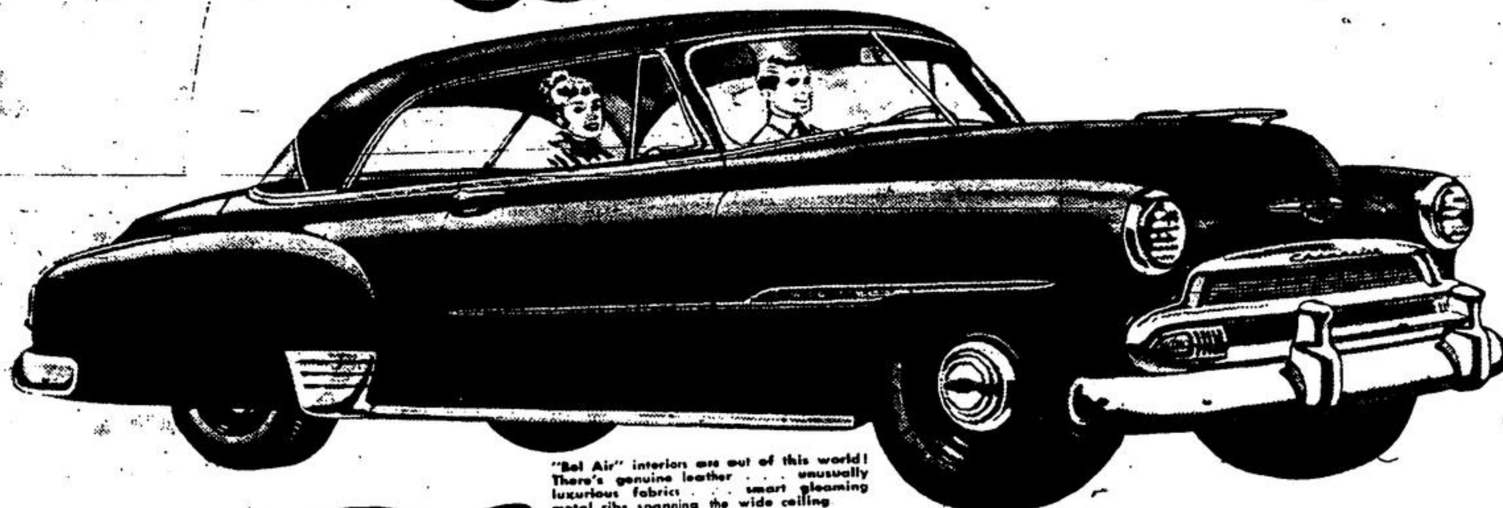
"Bel Air" interior one out of this world! There's genuine leather... luxuriant fabrics... smart gleaming metal ribs spanning the wide ceiling.