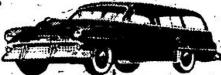
NEW DODGE SAVOY

White Sidewall Tires Optional at Extra Cost.