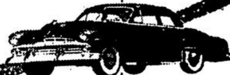
DODGE REGENT Club Coupe

White Sidewall Tires Optional at Extra Cost.