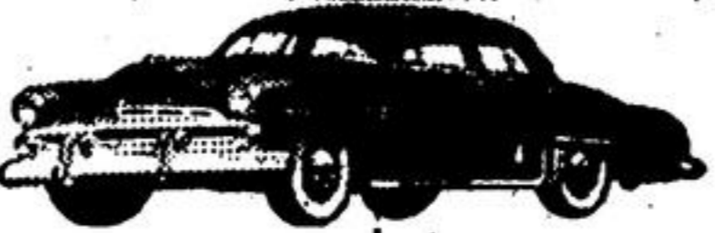
DODGE CRUSADER 4-Door Sedan