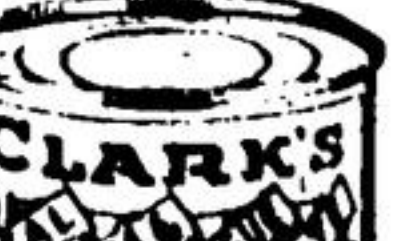
Beef, Tongue and Liver