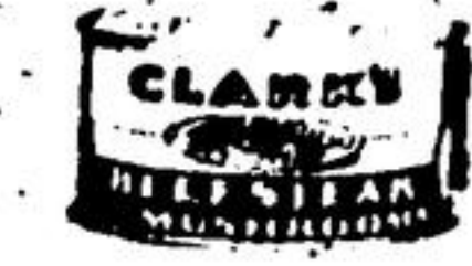
Beef Steak and Mushrooms