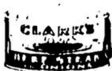
Beef Steak and Onions