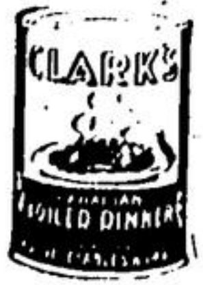
Canadian Boiled Dinner