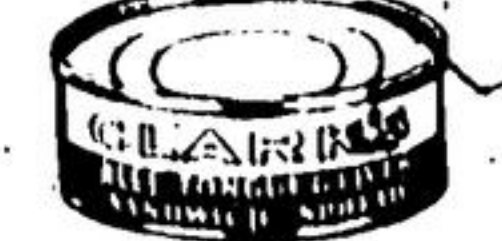
Veal, Ham and Tongue