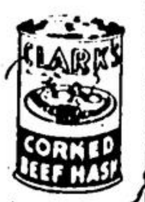
Corned Beef Hash