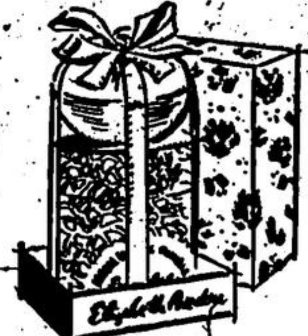
Soft-as-snow Dusting Powder, with tony June Geranium Bath Soap, 2.10

Dough it with fragrance for both time. These Gift Sets by Elizabeth Arden, charmingly gay and imaginative add lovely luxury to lovely leisure. Each a complement to her and to your own good taste.