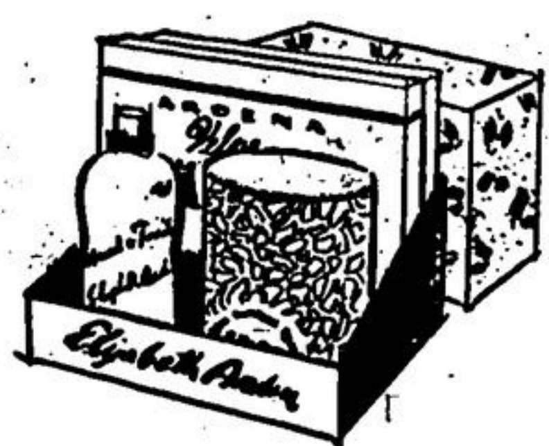
Creamy Hand-O-Toeik, fluffy Dusting Powder and sudsy Velva Bath Milk . . . . . 3.35

MACCORMACK'S DRUG STORE PHONE 327 GEORGETOWN