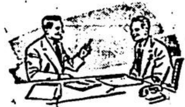
Lower cost per mile!

Chevrolet's Valve-in-Head design, constantly refined and improved during 35 years of development, makes possible the smooth, even burning of the fuel — Blue-Flame combustion. Combustion chambers are scientifically shaped to wring more power from every drop of gasoline.