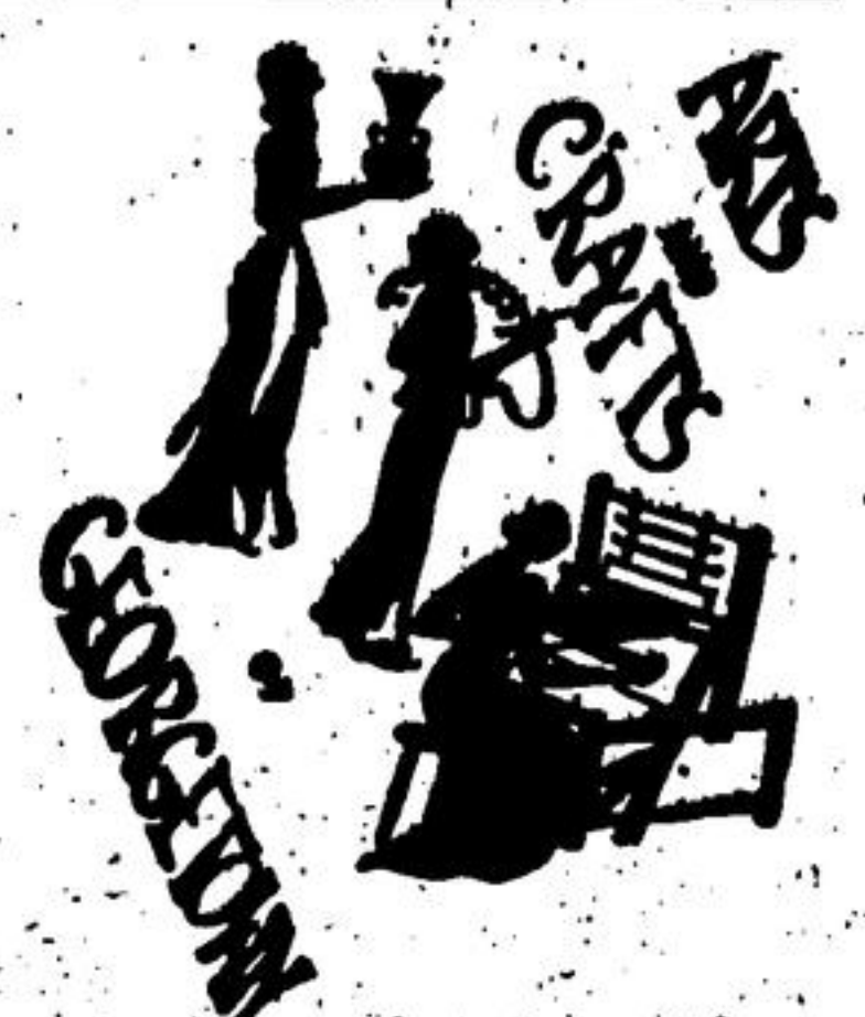
EXHIBIT and SALE SATURDAY, DEC 9th LEGION HALL 1.30 to 5.30 Demonstrations of pottery making, weaving, leather work, spinning, and other handicrafts. FREE ADMISSION Afternoon Tea: 35c