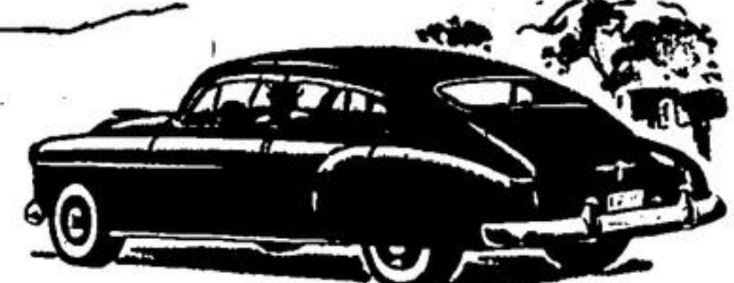
Four-Door Sedan, Fleetline Series. Available in Deluxe and Special Models.

In Four-Door Sedans you take your choice of the Fleetline, with its sweeping "fast back", (above) or the long-looking Styleline (below). And there are two Styleline Sports Coupes and a dignified Business Coupe. Besides all Chevrolet's model choice, there's a big range of Factory-Approved accessories — grand convenience features especially designed to make motoring more fun for a Chevrolet owner — and offered exclusively by your Chevrolet dealer.