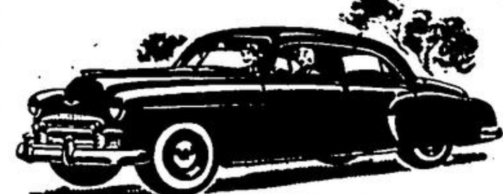
Four-Door Sedan, Styleline Series. Available in Deluxe and Special Models.

In Four-Door Sedans you take your choice of the Fleetline, with its sweeping "fast back", (above) or the long-looking Styleline (below). And there are two Styleline Sports Coupes and a dignified Business Coupe. Besides all Chevrolet's model choice, there's a big range of Factory-Approved accessories — grand convenience features especially designed to make motoring more fun for a Chevrolet owner — and offered exclusively by your Chevrolet dealer.