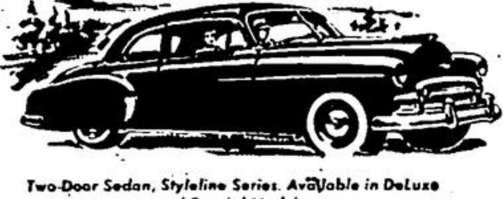
Two-Door Sedan, Styleline Series. Available in Deluxe and Special Models.

Take your choice of two widely different, style-leading two-door sedans — both of them available in either standard or de luxe appointments. The Fleetline De Luxe Two-Door Sedan (above) features a roof and back line which is one continuous, rakish curve. Yet with all its dash, headroom and trunk room are not sacrificed: The Styleline Series, illustrated (below), in the De Luxe Two-Door Sedan, gives you an impressive big-car look, with its graceful "notch-back" styling — and it's all Chevrolet, through and through!