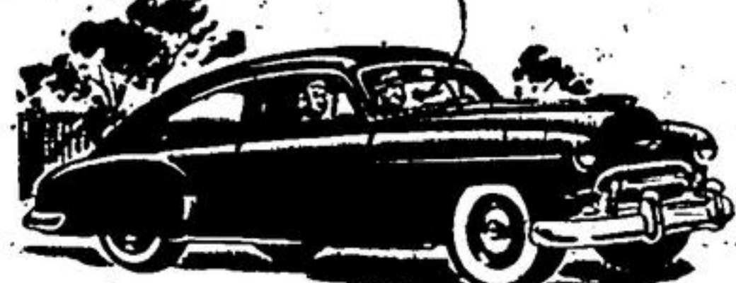
Two-Door Sedan, Fleetline Series. Available in Deluxe and Special Models.

Only Chevrolet offers such a wide and wonderful choice ... and at the lowest prices, too!