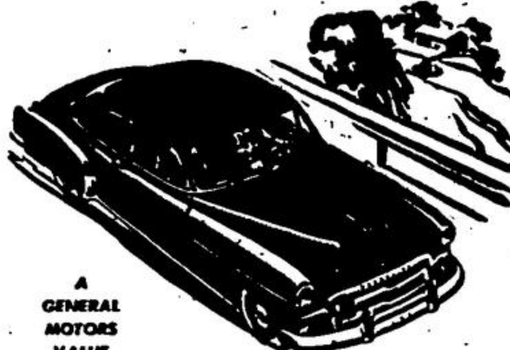
A GENERAL MOTORS VALUE

There's hip-room, head-room, leg-room and room to spare for six adult passengers in a Chevrolet. The big doors swing wide to let you in and out without undue stooping or crouching. And the bigger, more capacious trunk has ample room for all your luggage — and your passengers', too!