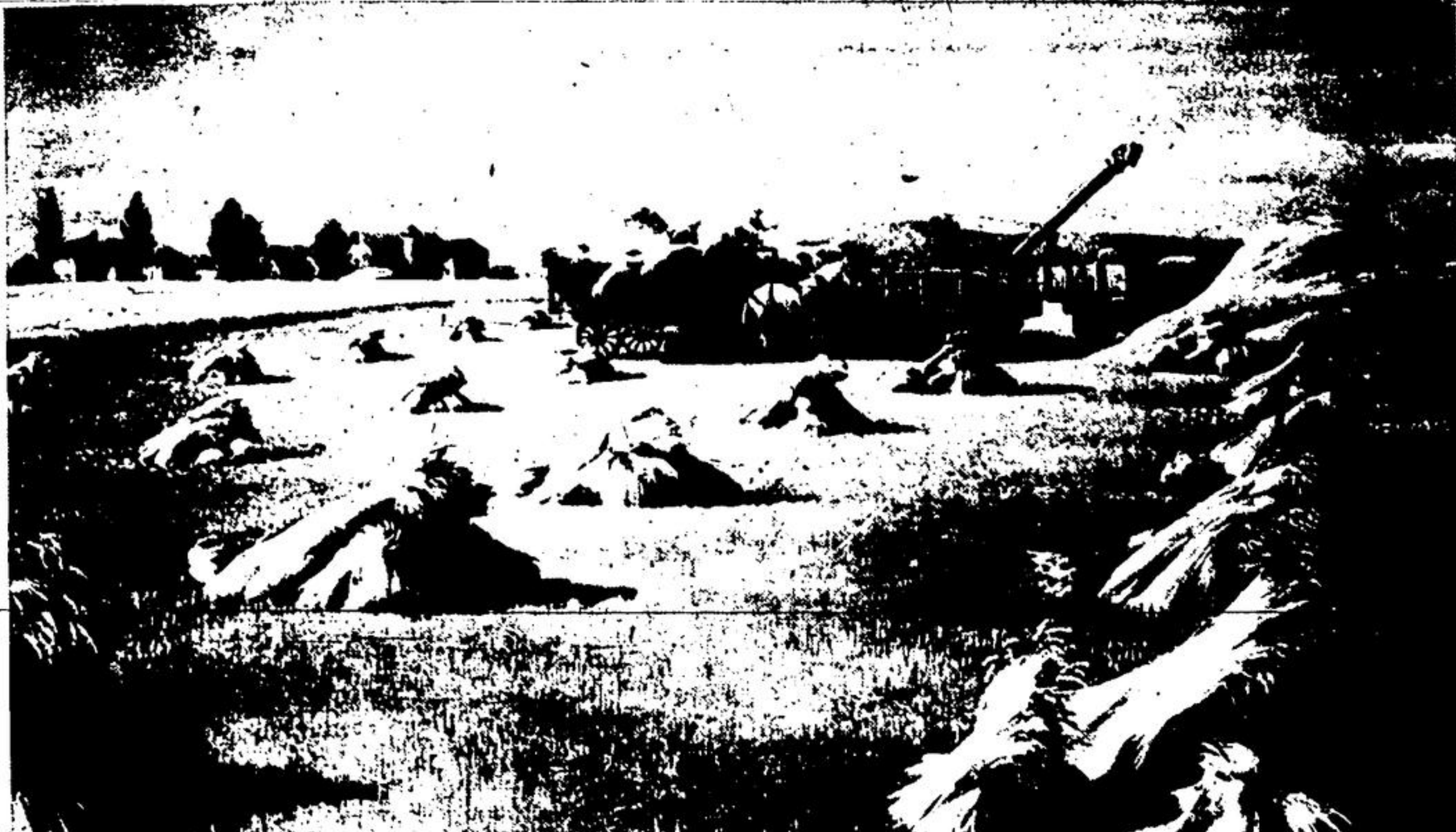
Each year, Canada, one of the world's greatest granaries, ships abroad millions of bushels of wheat and other life-sustaining grains. The peoples of many lands depend on Canada's rich harvest for their daily bread.