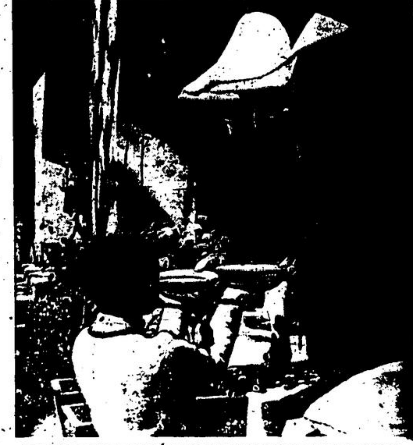
A nun delegates a young "waiter" to help her serve bowls of soup — an extra on the schoolchildren's menu, in Mayrhofen, Austria — made possible by help from the United Nations International Children's Emergency Fund (UNICEF). The children are served their extra lunch each day at an inn operated by the mayor of the village.

reported that enrolment in Kindergarten-primary in September is 1,000 years old were found last year anticipated as 52, according to a survey made this spring.