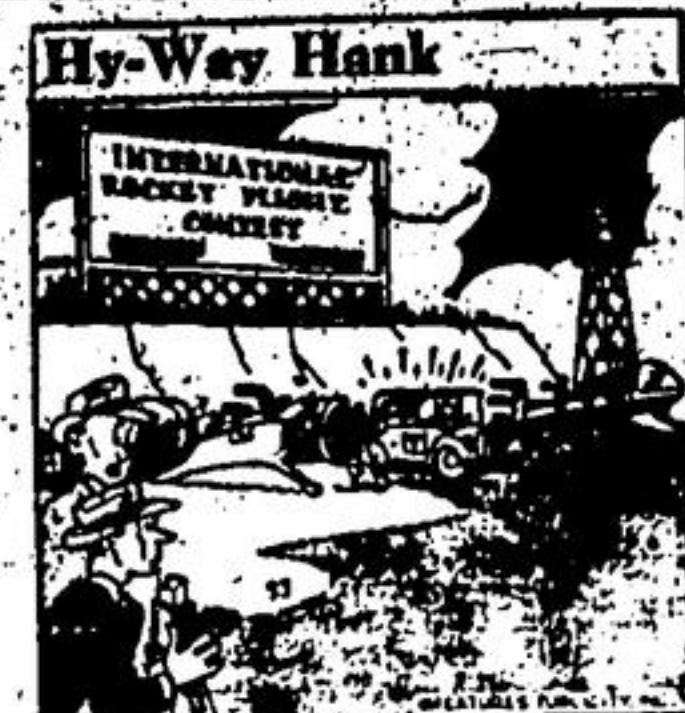
The odds are starting to pile up in his favor... they say he just had a complete White Rose Lubrication job.