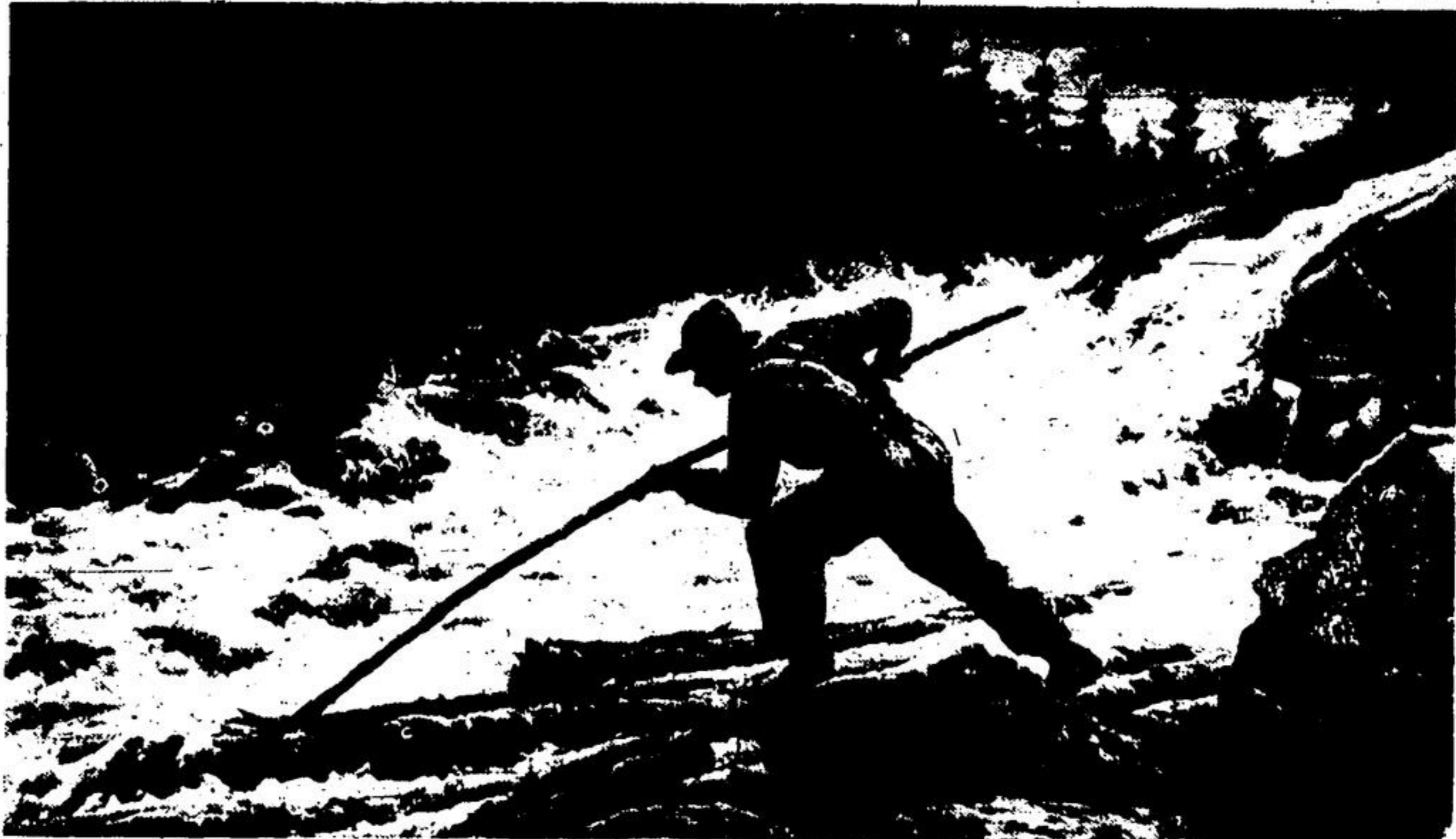
In all likelihood, the newspaper you read is printed on Canadian newsprint; for Canada produces 4 times as much newsprint as any other country in the world. 3 out of every 5 newspaper pages throughout the world are Canadian paper.