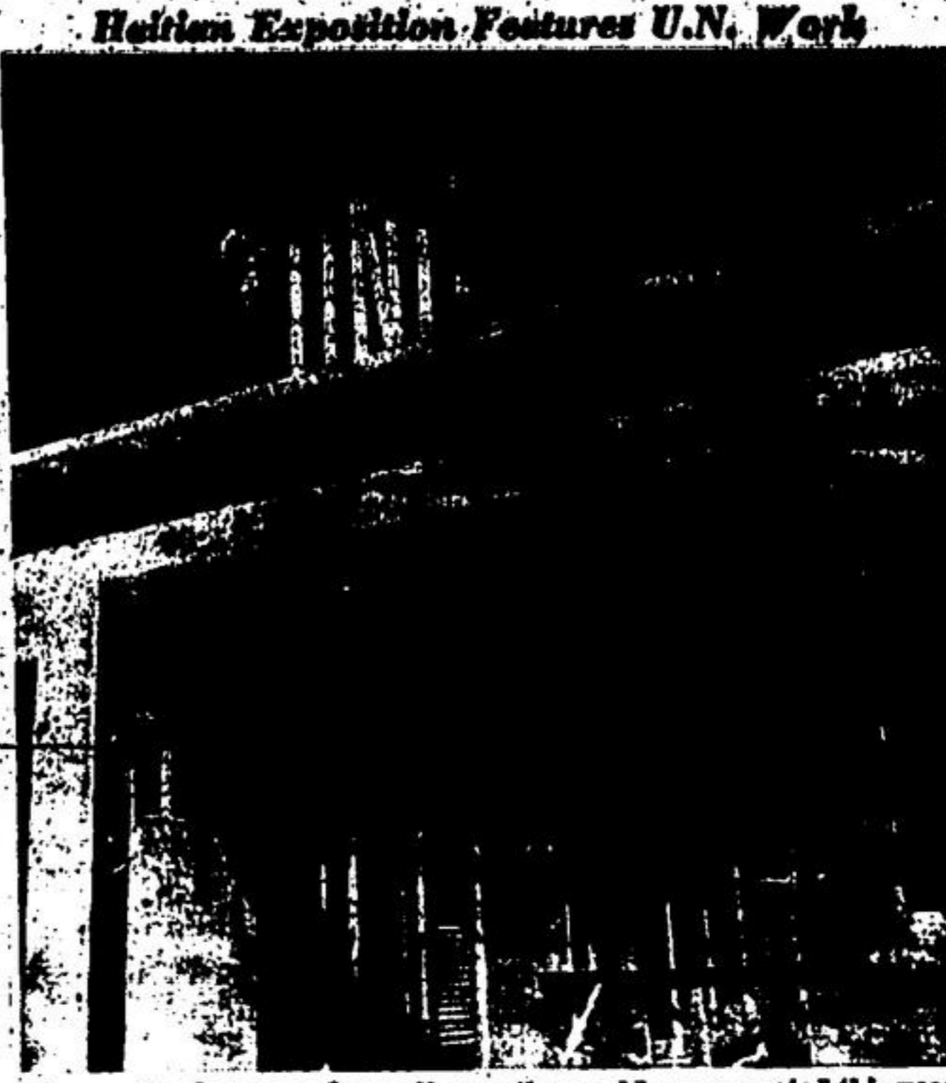
Thousands of persons from all over the world are expected this year to visit the International Exposition at Port-au-Prince, Haiti, to commemorate the two hundredth anniversary of the founding of that city. The exposition features a special United Nations exhibition, dramatizing the activities of the world organization. Above is one of the U.N. pavilions under construction in the Haitian capital.