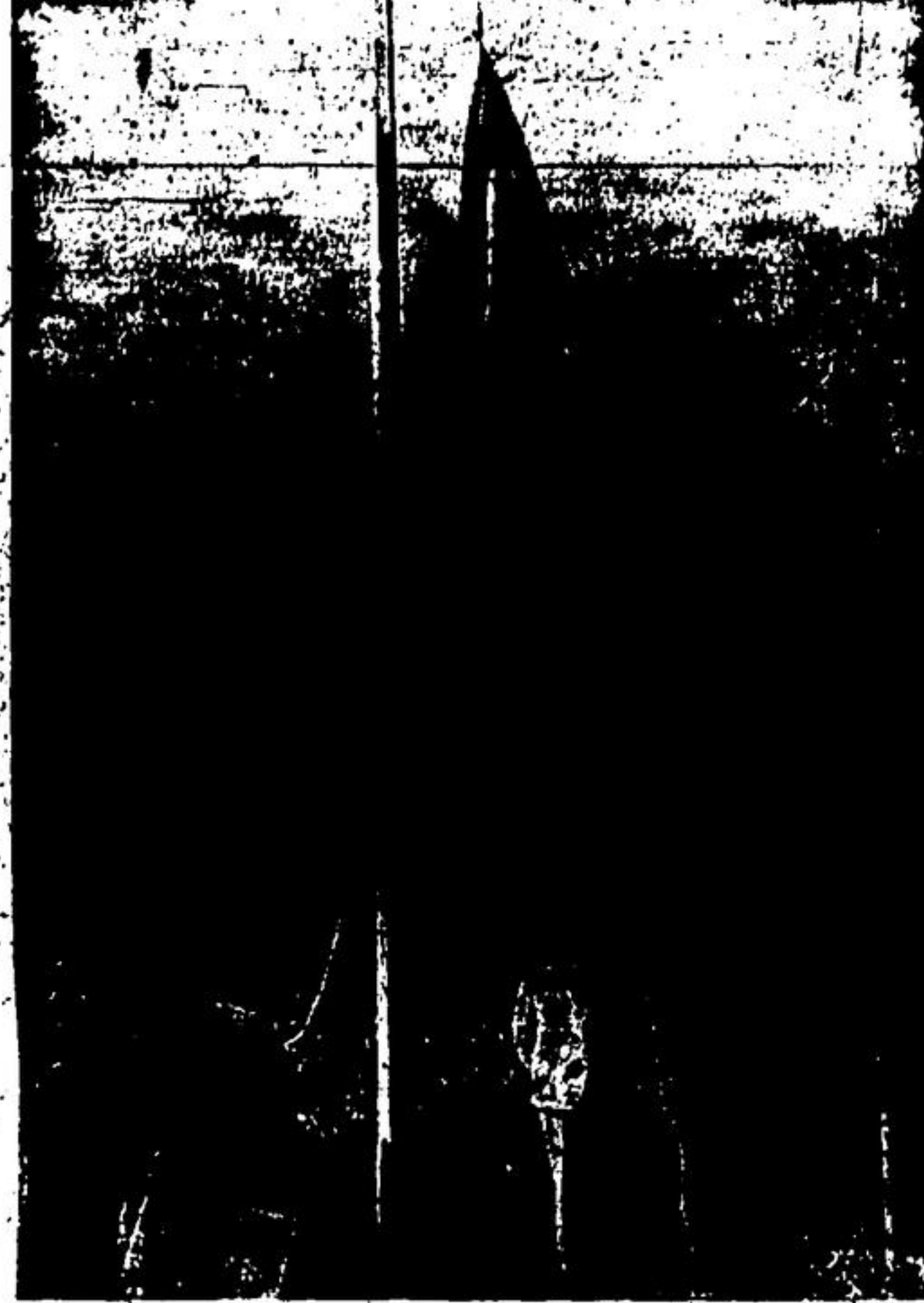
The blue-and-white flag of the United Nations is run to the top of a flag pole at the Eritrean capital of Asmara, signalling the beginning of work by the U.N. Commission for Eritrea. The Commission is now in the former Italian colony to ascertain the wishes of the inhabitants and to make recommendations on its future status.