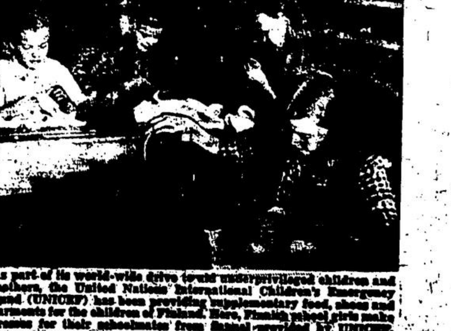
As part of its world-wide drive to aid underprivileged children and mothers, the United Nations International Children's Emergency Fund (UNICEF) has been providing supplementary food, shoes and garments for the children of Finland. Here, Finnish school girls make garments for their schoolmates from flannel provided by UNICEF.