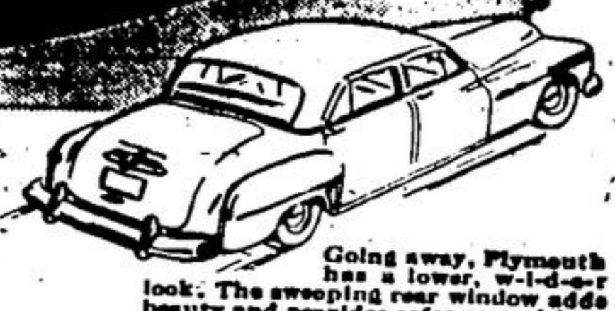
Going away, Plymouth has a lower, wider look. The swooping rear window adds beauty and provides safer rear vision. Wider tread increases stability.