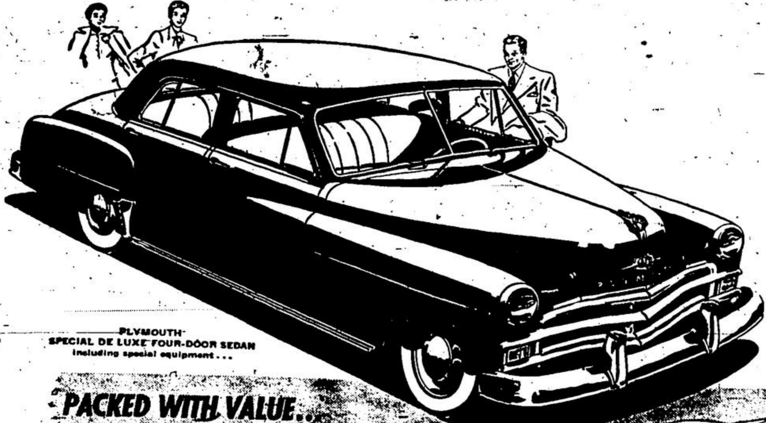
PLYMOUTH SPECIAL DE LUXE FOUR-DOOR SEDAN including special equipment...