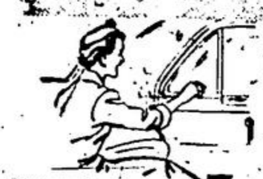
Plymouth's new styling is achieved without sacrificing interior room and comfort. Vent winds on all doors permit individual control of ventilation.