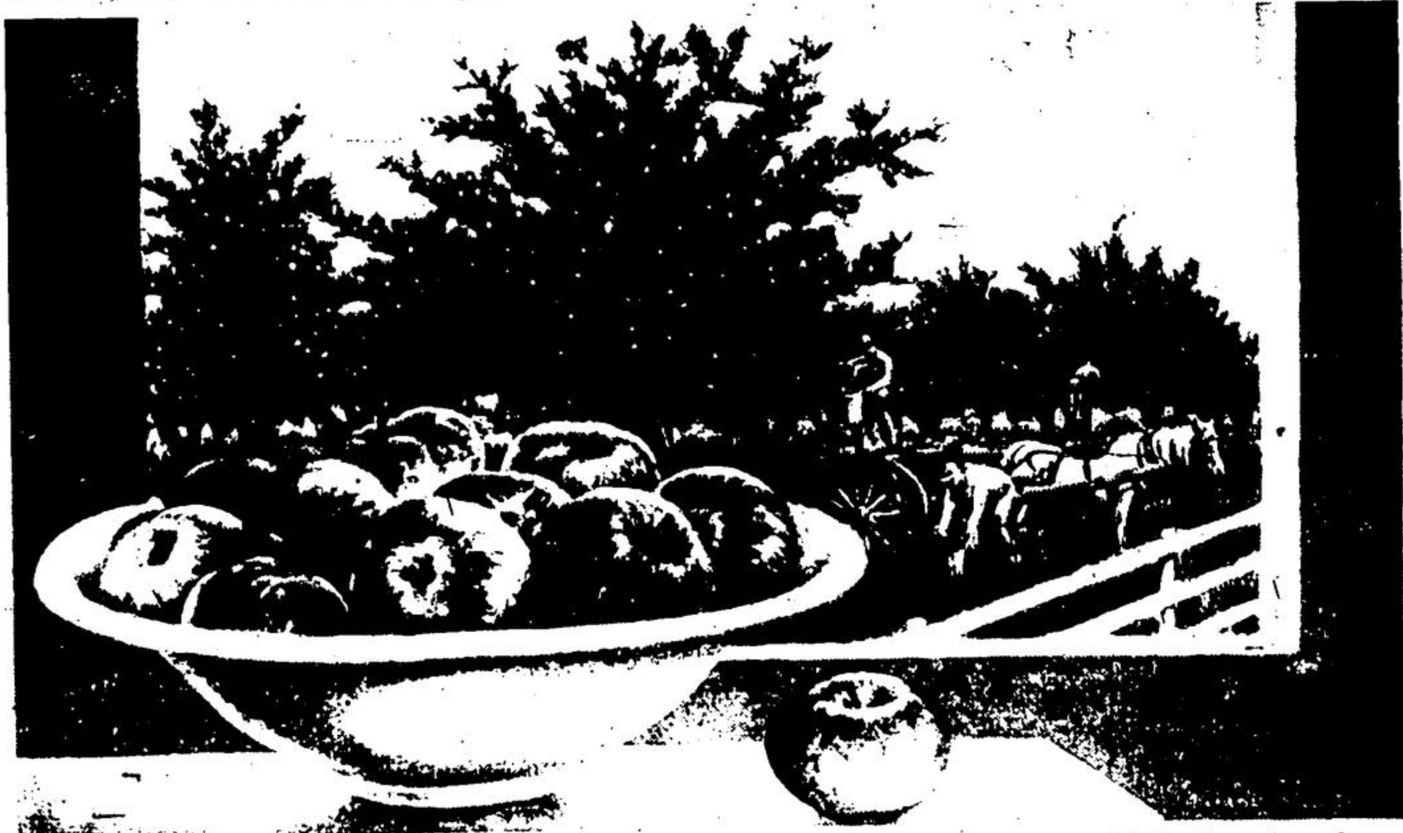
When choosing apples for eating or cooking, you look for fine flavor and firm texture — qualities for which Canadian apples are famous. Canada's invigorating climate and fertile soil produce many varieties of apples for the world's enjoyment.