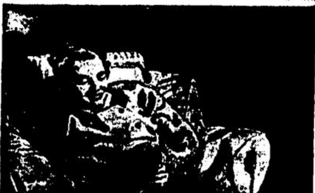
You'll sleep soundly in the soothing quiet of Canadian National night-travel accommodations, berths or rooms... air-conditioned for your comfort. Travel by train for dependable, all-weather service.

Comfort is the word for Canadian National travel. Whether you ride in coach or parlor car, you enjoy roomy armchair ease as the miles speed smoothly by. Stretch your legs when so minded, by a stroll to the smoking compartment or dining car. The hours pass swiftly and pleasantly. You arrive refreshed — when you go Canadian National.