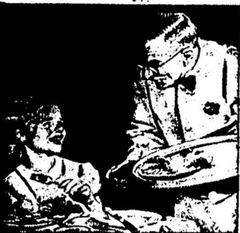
Mealtimes are a delight in Canadian National's inviting dining cars. Your favourite dishes, temptingly prepared, are deftly served in a cheerful, friendly atmosphere.

Comfort is the word for Canadian National travel. Whether you ride in coach or parlor car, you enjoy roomy armchair ease as the miles speed smoothly by. Stretch your legs when so minded, by a stroll to the smoking compartment or dining car. The hours pass swiftly and pleasantly. You arrive refreshed — when you go Canadian National.