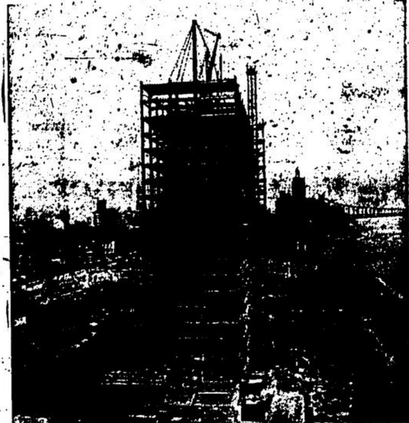
Steelwork on eighteen of the 28 stories of the United Nations Secretariat building in mid-Manhattan, New York, was completed in July when this picture was taken. A contract was signed by U.N. and the American Bridge Company for the furnishing and erection of structural steel for the building and for the furnishing and erection of structural steel for the building area of the Permanent Headquarters. The contract calls for 10,500 tons of structural steel at a cost of $2,225,000. Delivery is to be made by next October, and erection is expected to be completed by April or May 1954.