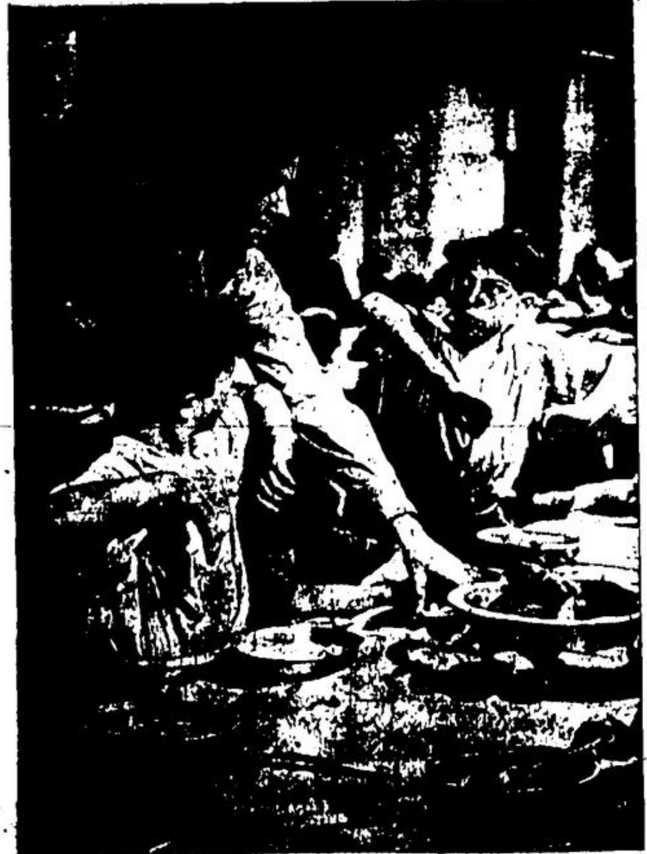
THIS SCENE from M-G-M's "The Search" shows wandering boys in post-war Germany under the care of an American field organization. Unable to realize that they are now with friends, they rise to show that they are not hiding any food.